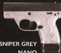
SNIPER GREY NANO