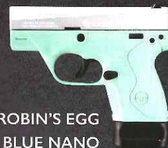
ROBIN'S EGG BLUE NANO