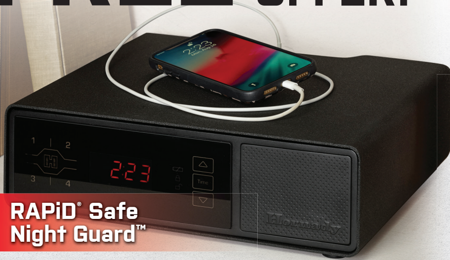
RAPiD® Safe Night Guard™