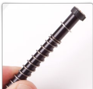
Completed Guide Rod Laser