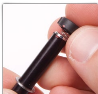
Locking Battery Cap Into Place