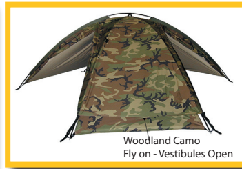
Woodland Camo Fly on - Vestibules Open