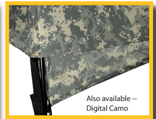
Also available -- Digital Camo