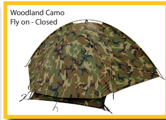
Woodland Camo Fly on - Closed