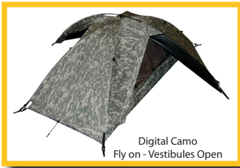
Digital Camo Fly on - Vestibules Open