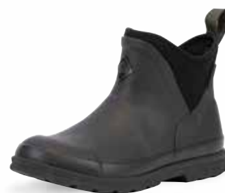
OAW-000 | Black