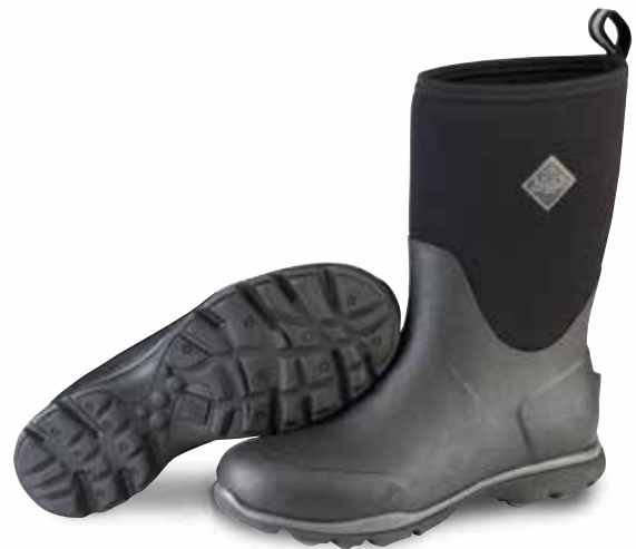
AEP-000 | Black/Gray