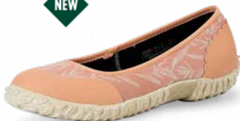
WMB-4WT | Muted Clay/Wheat Print