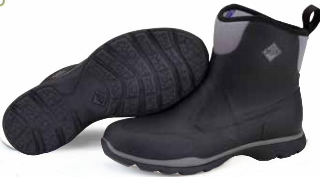
FRMC-000 | Black/Gunmetal