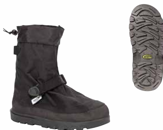
VNN1: Voyager™ Black, 10 in