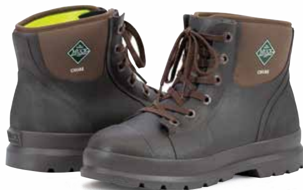
CH6-900 | Brown ASTM F2892-18 EH