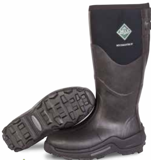
MMXF-000 | Black