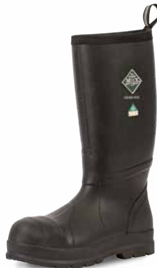
MAXR-CMP | Black ASTM F2413-18 M/I/C EH PR