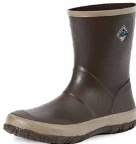
FRM-900 | Dark Brown