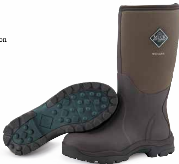
WMT-998K | Bark

Women Sizes: 6 - 11 Package 4 Pairs/Case