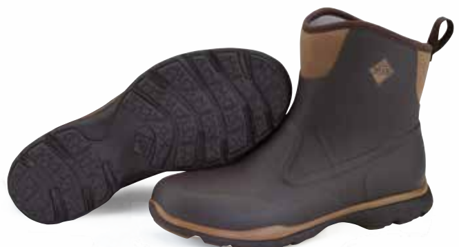
FRMC-900 | Bark/Otter