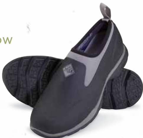
FRLC-000 | Black/Gunmetal