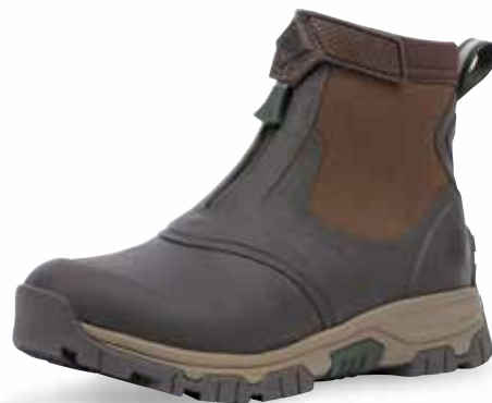
AXMZ-900 | Dark Brown