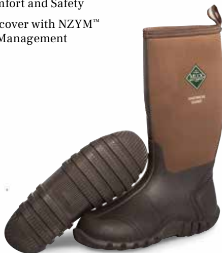
ECH-900 | Brown ASTM F2892-18 EH