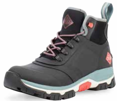
AXWL-000 | Black