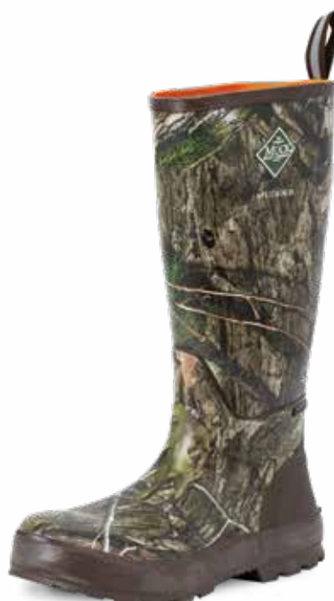
MUD-MDNA | Mossy Oak Country DNA® ASTM F2892-18 EH