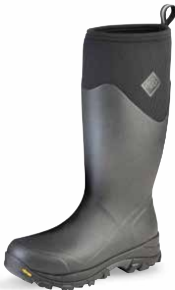
AVTVA-000 | Black