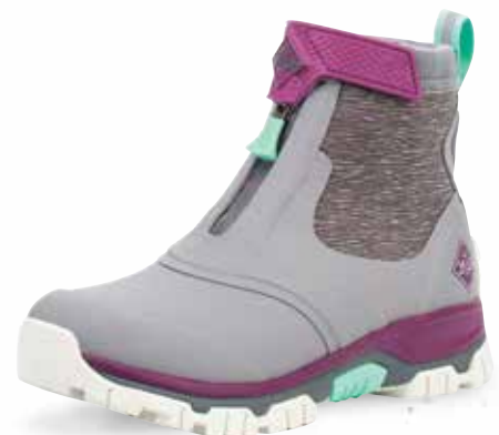
AXWZ-101 | Frost Gray