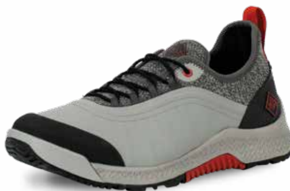
OSLM-100 | Gray