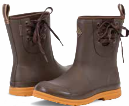
OMW-900 | Brown