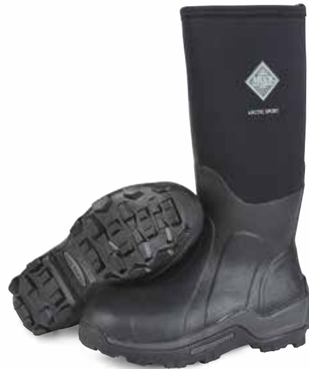
ASP-STL | Black ASTM F2413-18 M/I/C EH