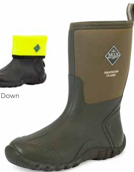
ECM-300 | Moss ASTM F2892-18 EH