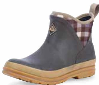
OAW-9PL | Brown/Plaid/Gum