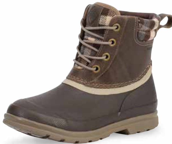
ODLW-109 | Walnut/Brown