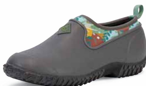
M2LW-102 | Gray/Print