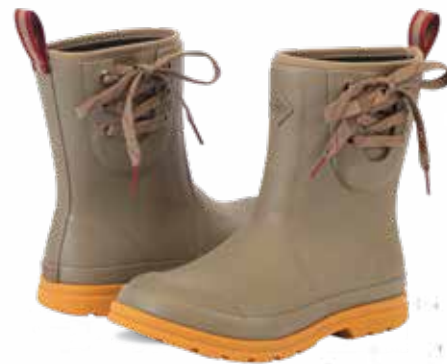
OMW-901 | Taupe