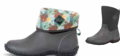
WM2-102 | Gray/Print