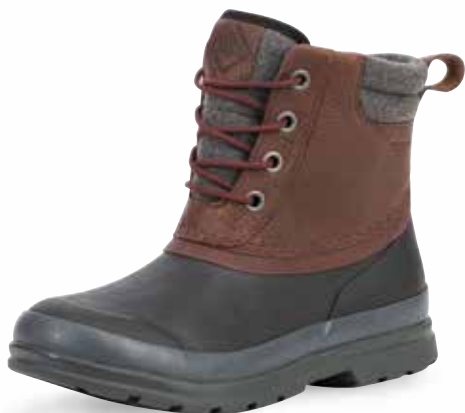
ODLW-900 | Brown/Black