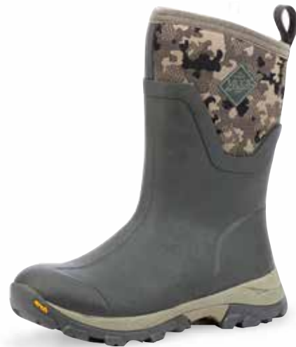
ASVMA-300 | Moss w/Camo