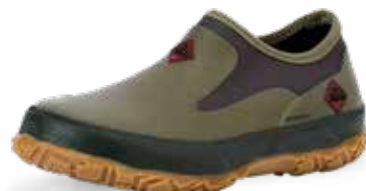
FRL-300 | Olive