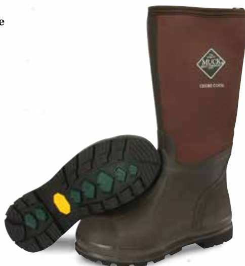
CHCT-900 | Brown ASTM F2892-18 EH