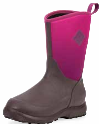
KEL-400 | Maroon/Pink/Fade