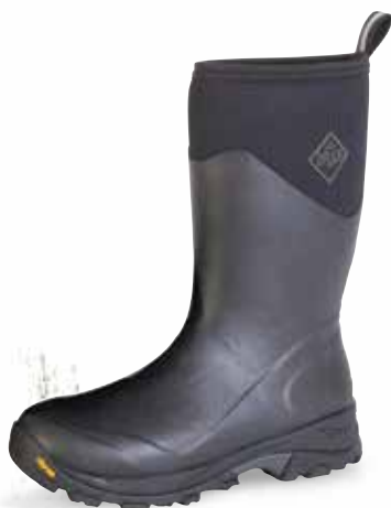
AVMVA-000 | Black