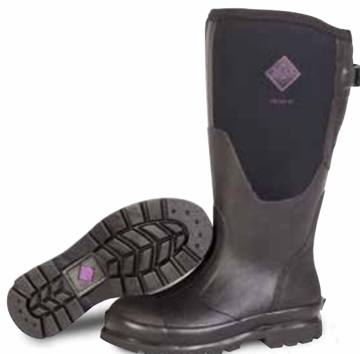
WCXF-000 | Black