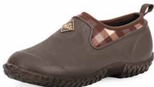
M2LW-9PLD | Brown/Plaid