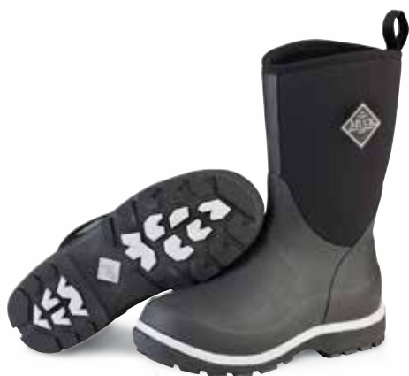
KEL-000 | Black