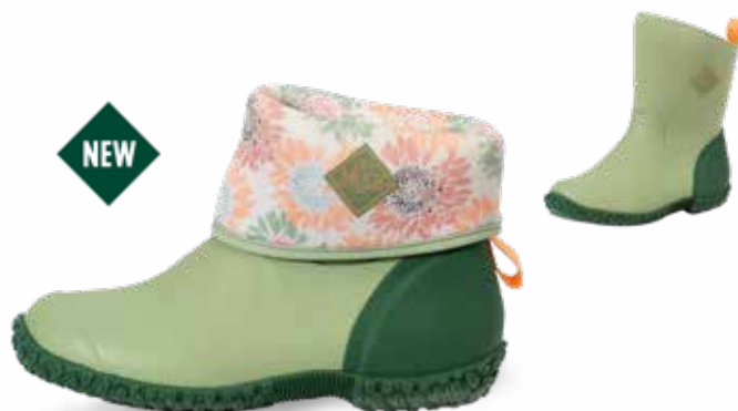
WM2-303 | Reseda