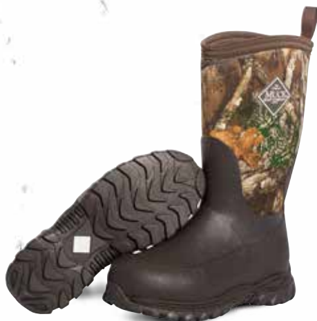
RG2-RTE | Brown/Realtree EDGE™