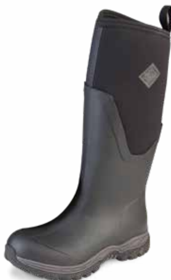
AS2T-000 | Black