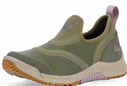
OSSW-300 | Olive