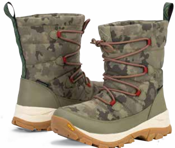
NWVA-300 | Olive/Camo