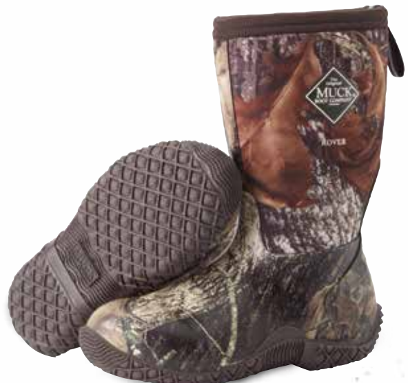
RVT-MOBU | Mossy Oak Break-Up