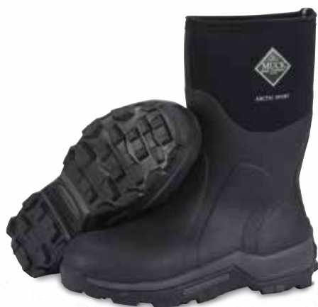
ASM-000A | Black