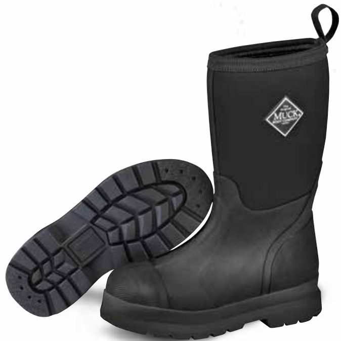
KCH-000 | Black