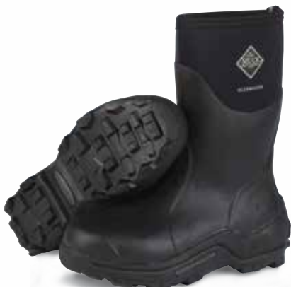
MMM-500A | Black