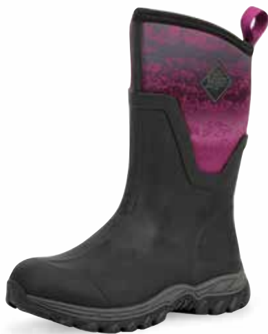
AS2M-004 | Black/Magenta Digi Fade Print