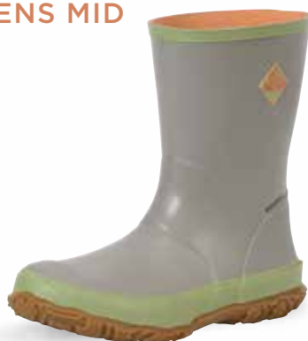
FRMW-103 | Light Gray/Reseda