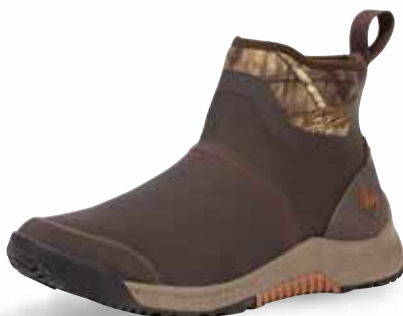
OSC-MOBU Brown/Mossy Oak Break-Up Country®