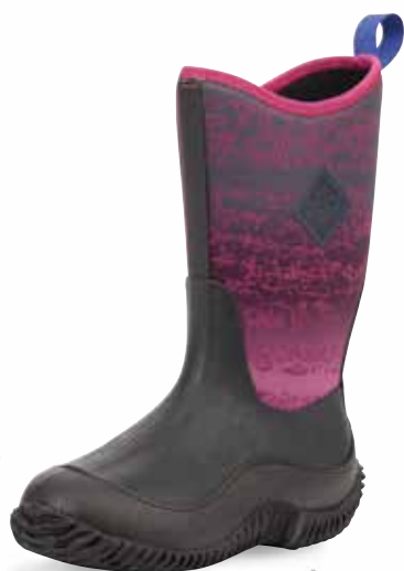
KBH-004 | Black/Magenta Digi Terrain Fade