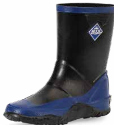
FRK-002 | Black/Blue