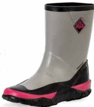
FRK-104 | Gray/Pink