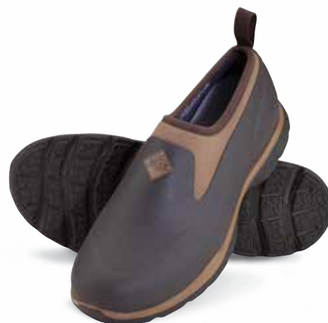
FRLC-900 | Bark/Otter