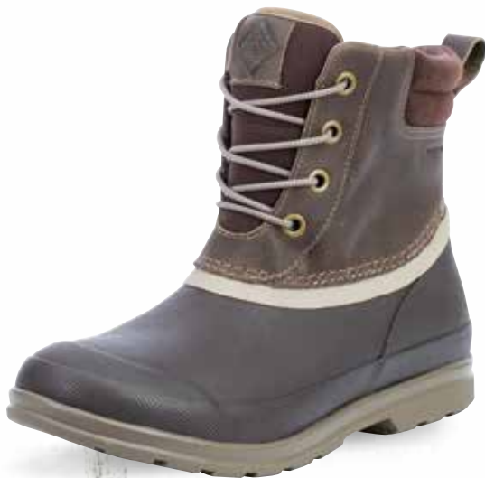
ODL-901 | Taupe/Dark Brown