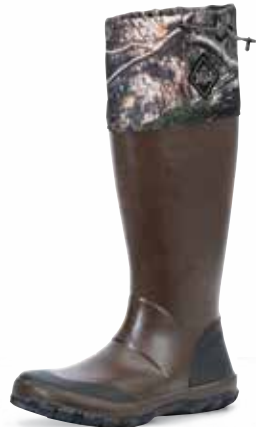
FOR-MDNA Mossy Oak Country DNA®