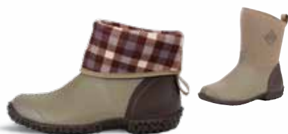
WM2-9PLD | Walnut/Plaid