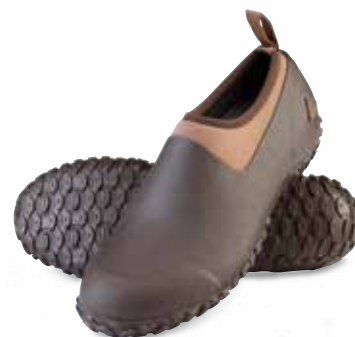
M2L-900 | Bark/Otter