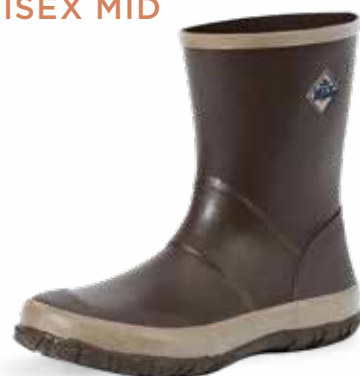
FRM-900 | Dark Brown