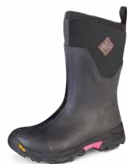
ASVMA-404 Black/Hot Pink