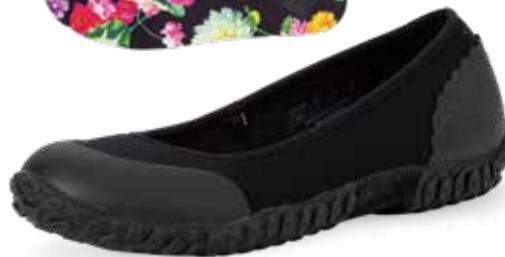
WMB-001 | Black/Night Floral