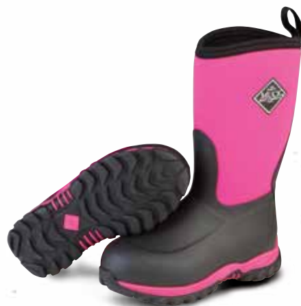
RG2-400 | Black/Pink