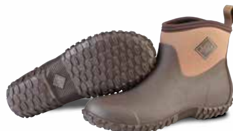
M2A-900 | Bark/Otter