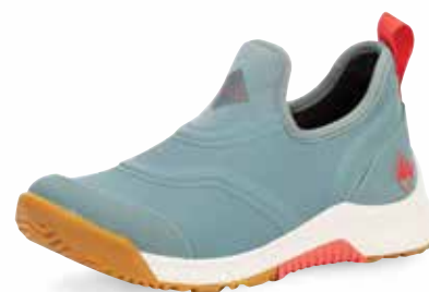
OSSW-200 | Trooper Blue