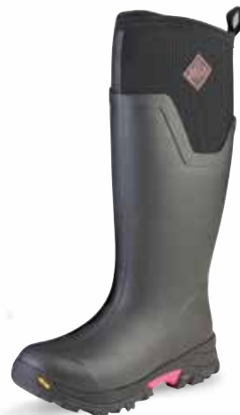
ASVTA-404 Black/Hot Pink