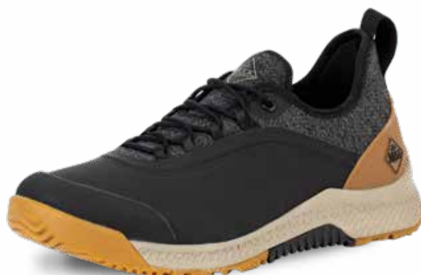
OSLM-000 | Black/Tan