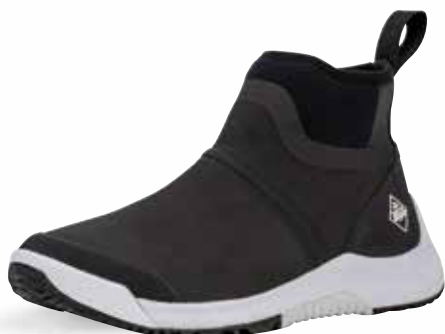
OSCW-000 | Black