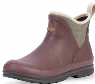
OAW-9TW Rum Raisin/Tweed Herringbone