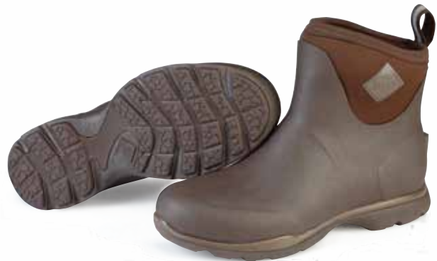
AELA-900 | Brown