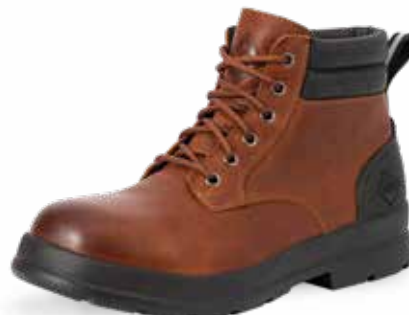
CLLP-901 | Caramel ASTM F2892-18 EH