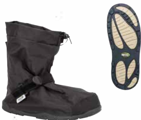
VIS1: Villager, Black, 11 in