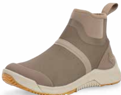
OSCW-901 | Walnut