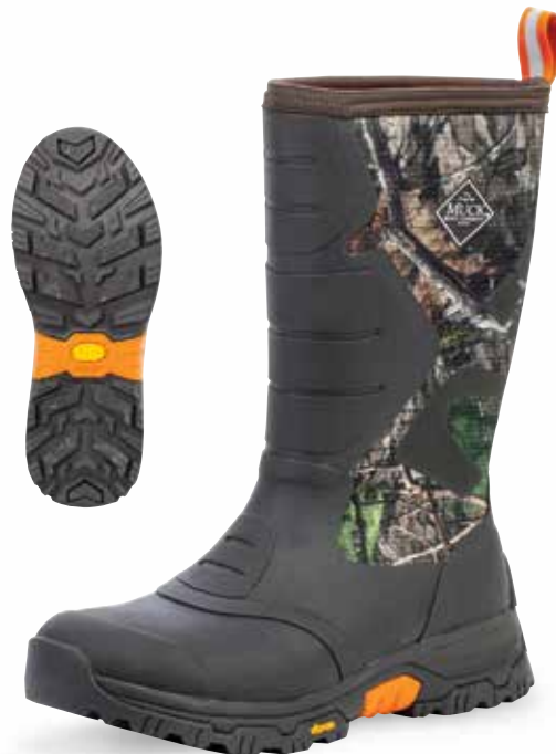
APMT-MDNA | Bark/Mossy Oak® Country DNA