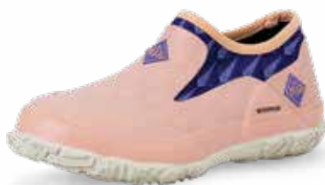
FRLW-401 | Muted Clay/Wheat Print