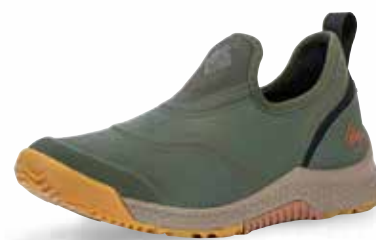
OSS-300 | Moss