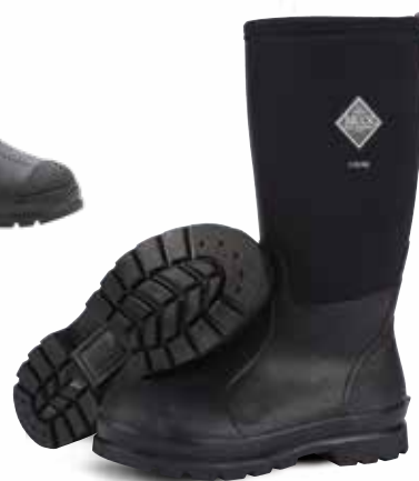
CHH-000A | Black ASTM F2892-18 EH