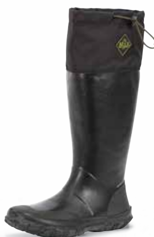
FOR-000 | Black