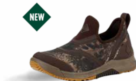
OST-MDNA | Mossy Oak Country DNA®