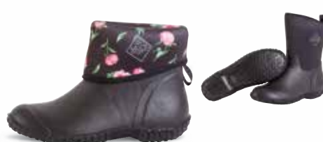
WM2-1ROS | Black/Charcoal/Rose Print