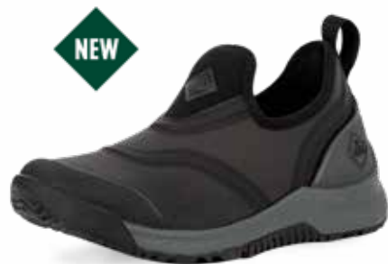
OSSW-001 | Black/Gray