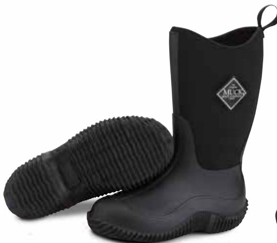
KBH-000 | Black/Black