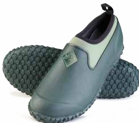
M2LW-300 | Green