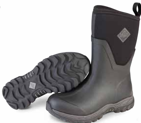
AS2M-000 | Black