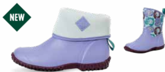
WM2-2FLR | Blue Iris/Sunflower Print