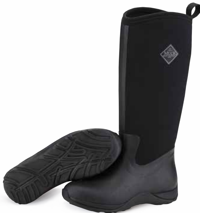
WAA-000 | Black

Women Sizes: 5 - 11 Package 4 Pairs/Case