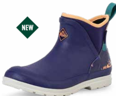
OAW-5FLR Astral Aura/Floral Heel