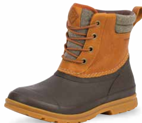
ODLW-902 | Tan/Dark Brown