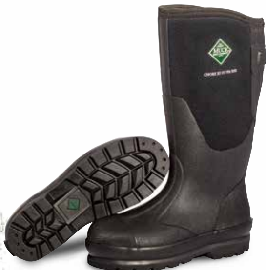
WCXF-STL | Black ASTM F2413-18 F/I/C EH P