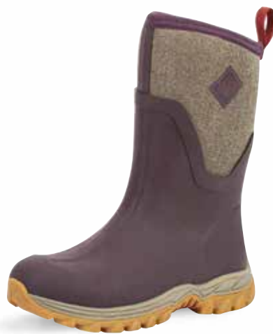
AS2M-6TW | Wine Tasting/Herringbone