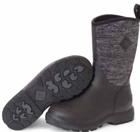
KEL-1JER | Black/Heathered Jersey