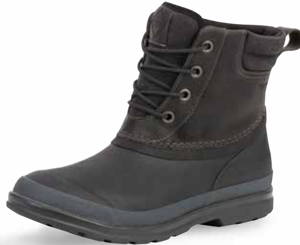
ODL-000 | Black