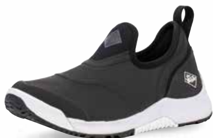
OSSW-000 | Black