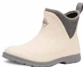
OAW-100 | White/Gray