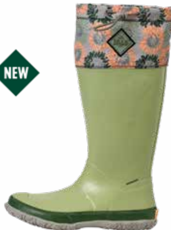
FORW-303 | Reseda/Sunflower Print