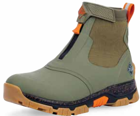
AXMZ-302 | Olive