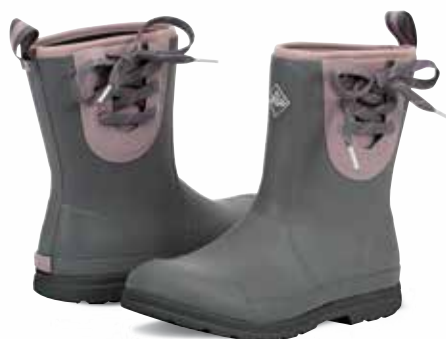
OMW-105 | Gray/Quail