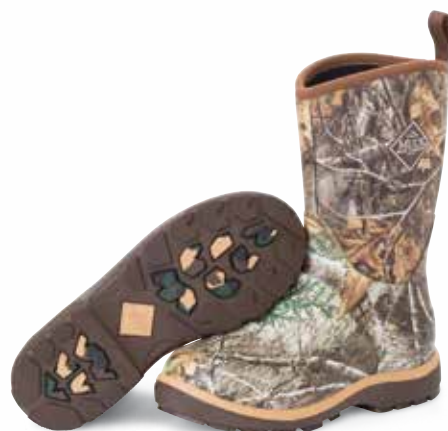
KEL-RTE | Realtree EDGE™/Bison/Tan