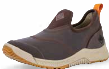
OSS-900 | Brown