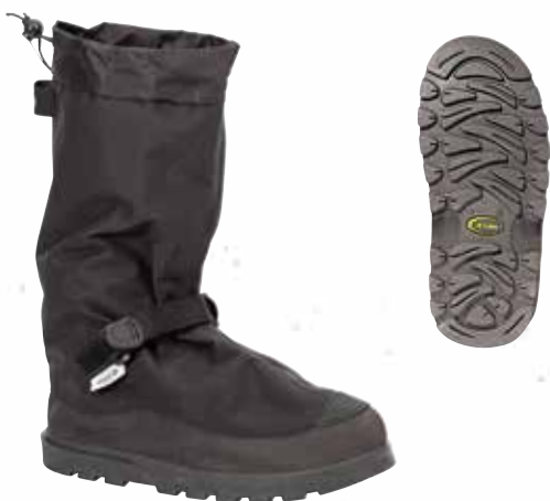
ANN1: Adventurer™ Black, 15 in