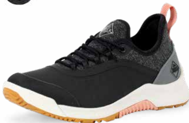
OSLW-000 | Black/Muted Clay