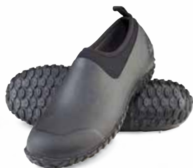
M2L-000 | Black/Brown