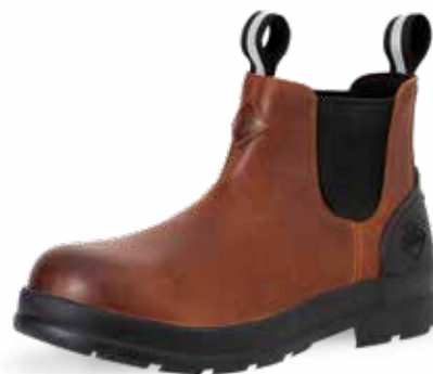
CCLP-901 | Caramel ASTM F2892-18 EH