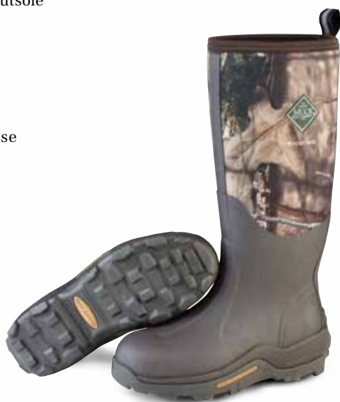
WDM-MOCT | Bark/Mossy Oak® Break-Up Country®