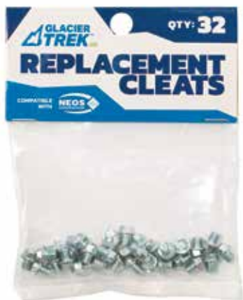
GSRCSLV: Glacier Trek SPK Replacement Cleats