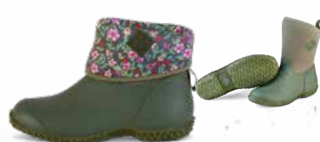
WM2-333T | Green/Floral Print