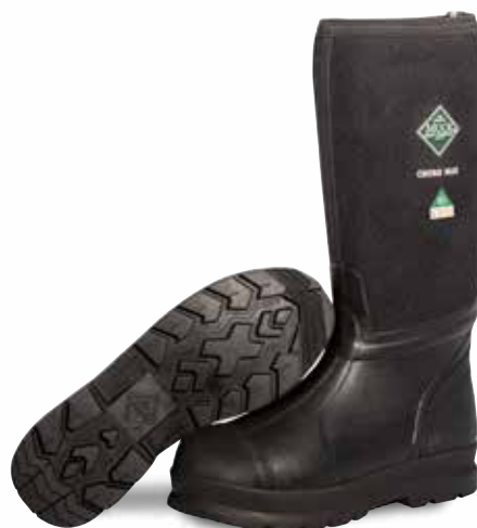
MAX-CMPF | Black ASTM F2413-18 M/I/C EH PR