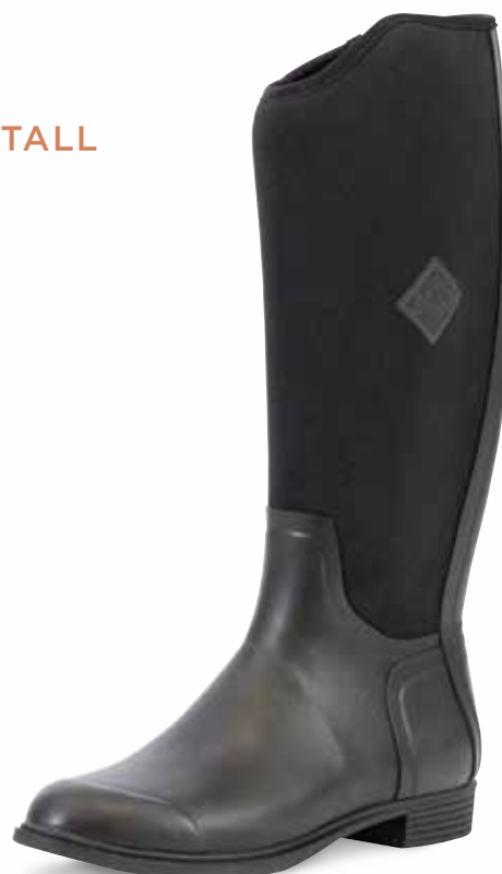
DBYT-000 | Black