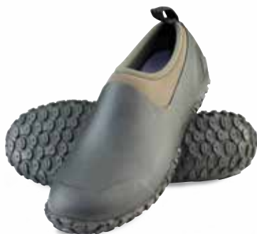
M2L-300 | Moss/Green