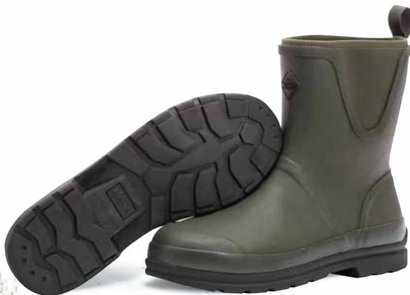
OMM-300 | Moss