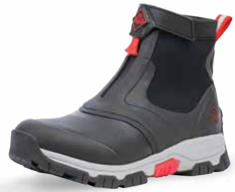
AXMZ-106 | Black/Gray/Red