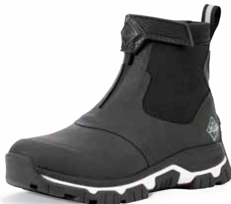
AXWZ-000 | Black/White