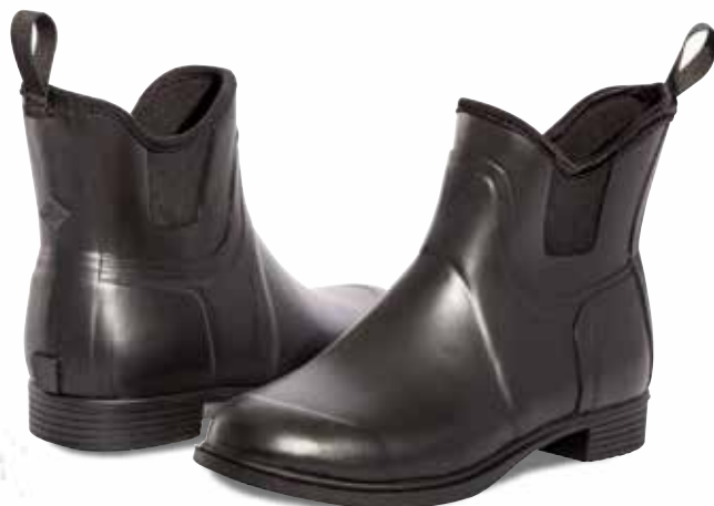
DBY-000 | Black