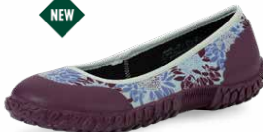
WMB-5FLR | Astral Aura/Sunflower Print