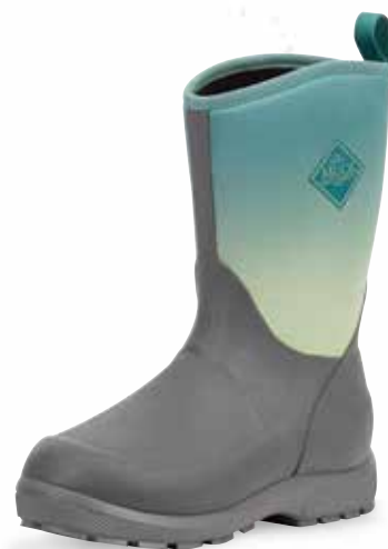
KEL-102 | Gray/Teal Fade