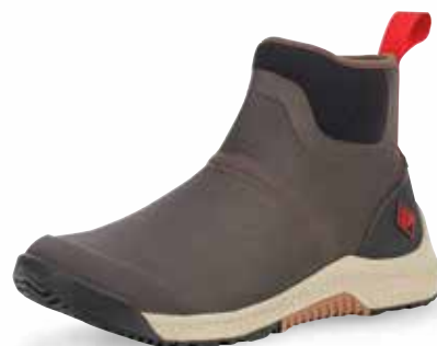
OSC-900 | Brown