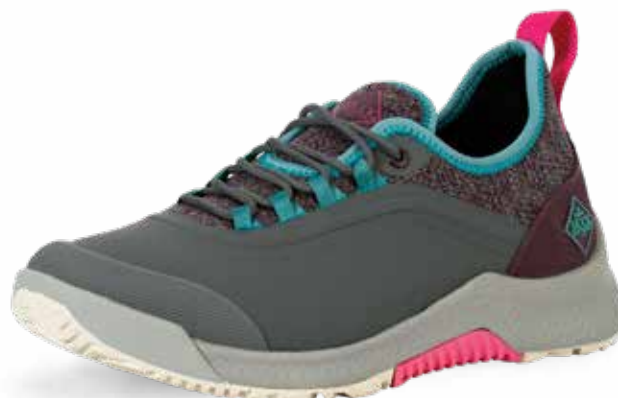
OSLW-104 | Dark Gray/Teal/Pink