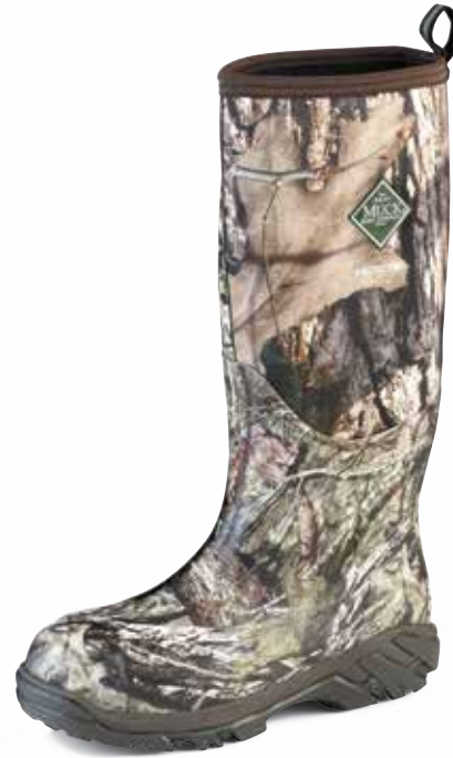
ACP-MOCT | Mossy Oak Country®