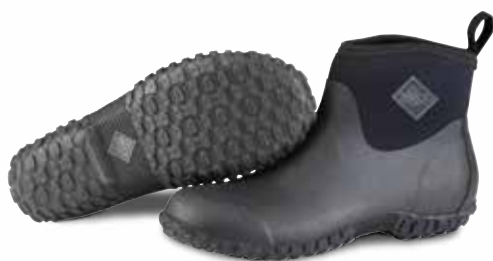
M2A-000 | Black/Black