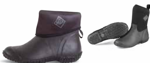
WM2-000 | Black/Charcoal Print