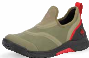
OSS-306 Burnt Olive/Ribbon Red/Black