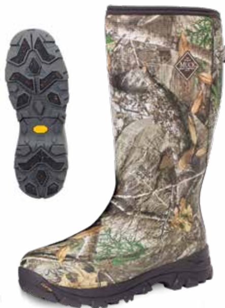
MHVA-RTE | Bison/Realtree EDGE™