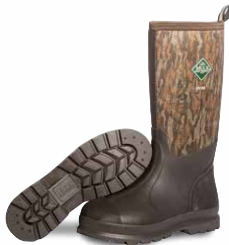
CHH-MOB Brown/Mossy Oak New Bottomland Camo ASTM F2892-18 EH