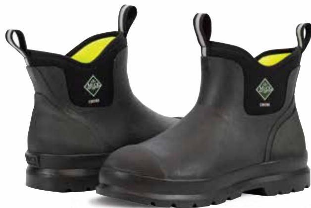
CHC-000A | Black ASTM F2892-18 EH