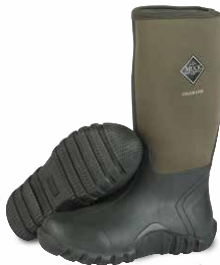
EWH-333T | Moss