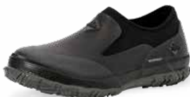
FRL-000 | Black