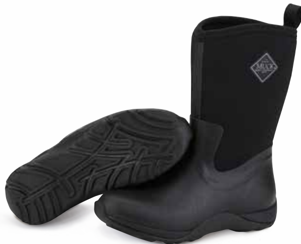
WAW-000 | Black

Women Sizes: 5 - 11 Package 4 Pairs/Case