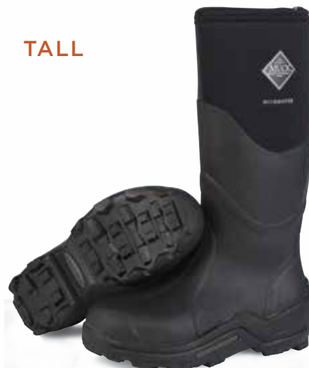
MMH-500A | Black