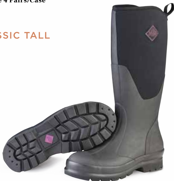
WCHT-000 | Black