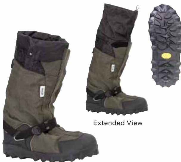
N5P3 : Navigator 5™ Gray, 15 in