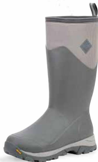
AVTVA-101 | Gray