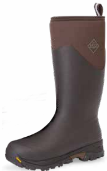
AVTVA-900 | Brown