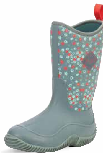
KBH-2FLR | Trooper/Winter Floral