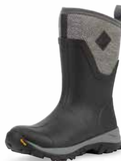
ASVMA-101 Black/Gray Geometric