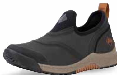
OSS-000 | Black