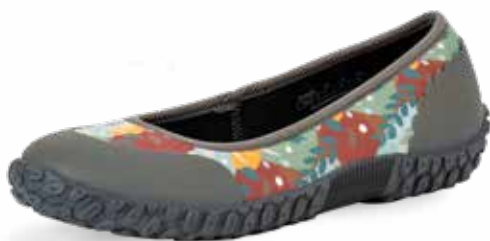
WMB-102 | Gray/Print