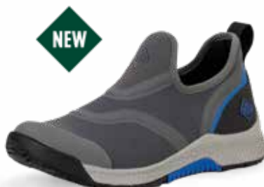
OSS-100 | Gray