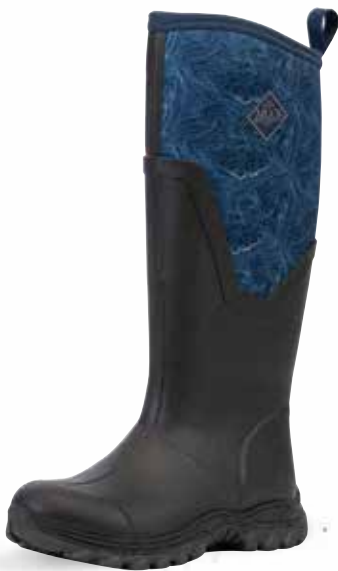
AS2T-201 | Black/Navy Topography