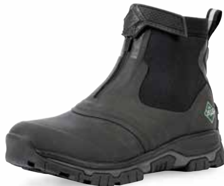
AXMZ-000 | Black/Gray