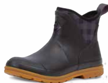
OAW-1PLD | Black/Plaid