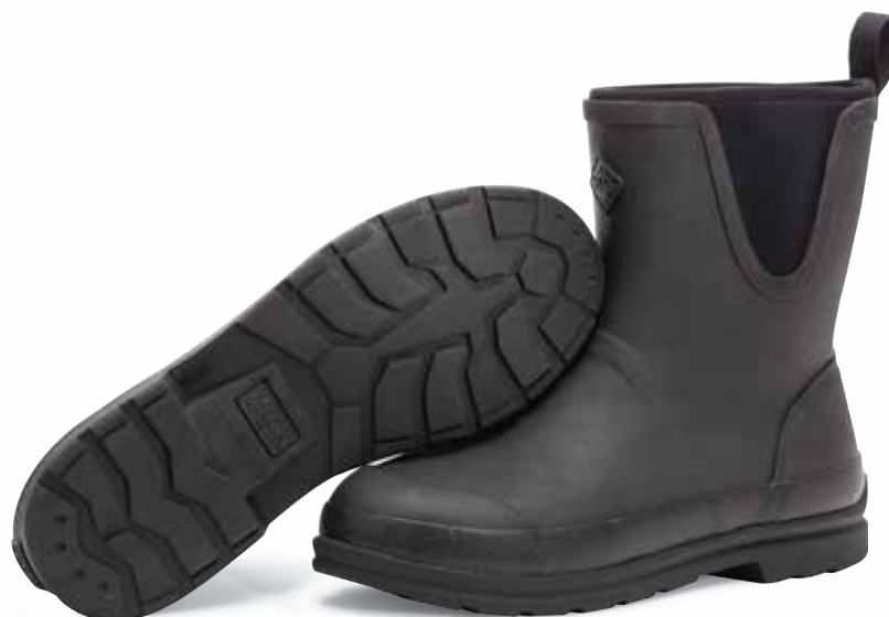
OMM-000 | Black