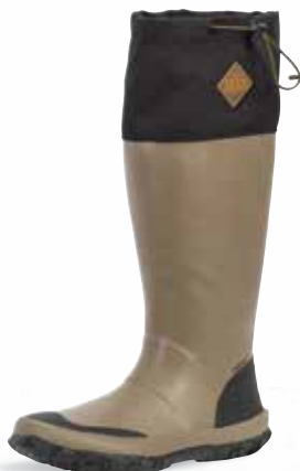
FOR-901 | Black/Tan