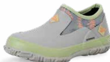
FRLW-100 | Light Gray/Sunflower Print