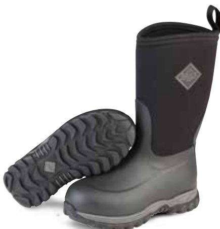
RG2-001 | Black/Black