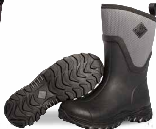
AS2M-101 | Gray