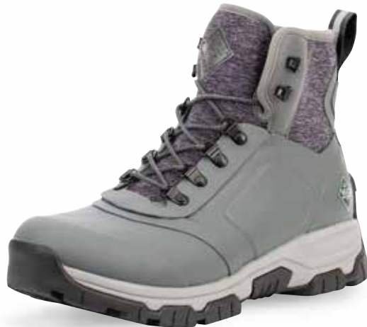
AXML-101 | Gray