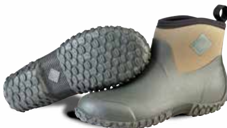
M2A-300 | Moss/Green