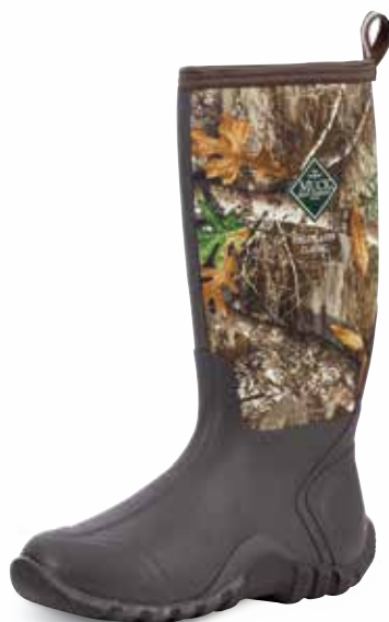
FBF-RTE | Brown/RealTree EDGE™ ASTM F2892-18 EH