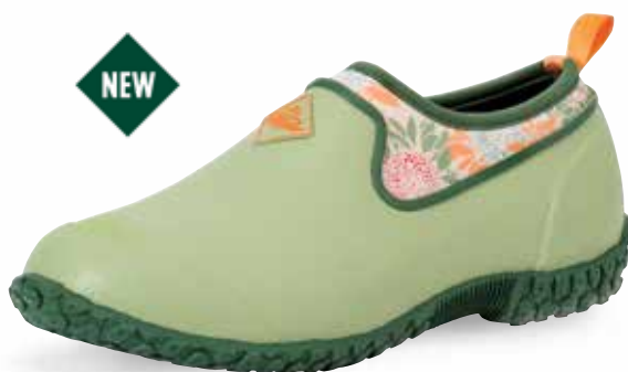
M2LW-303 | Reseda/Sunflower Print