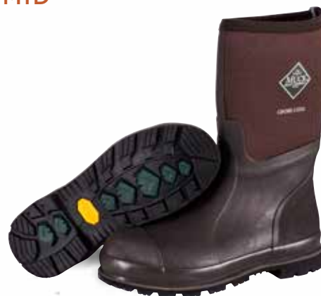
CMCT-900 | Brown ASTM F2892-18 EH