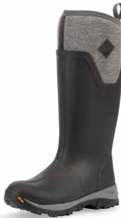
ASVTA-101 Black/Gray Geometric