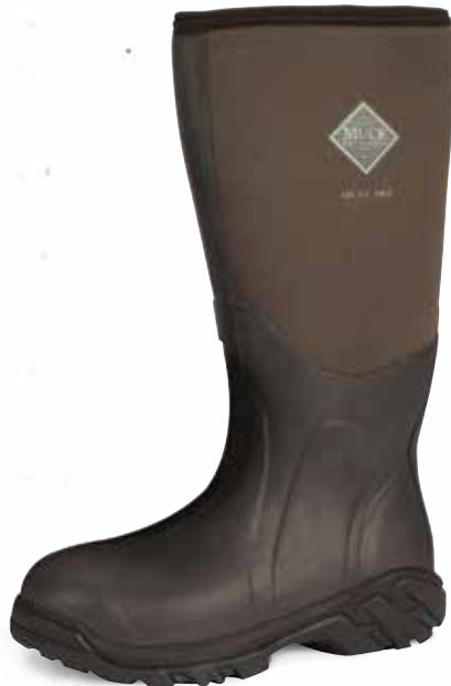
ACP-998K | Bark