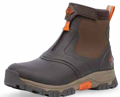
AXMZ-907 | Dark Brown/Orange