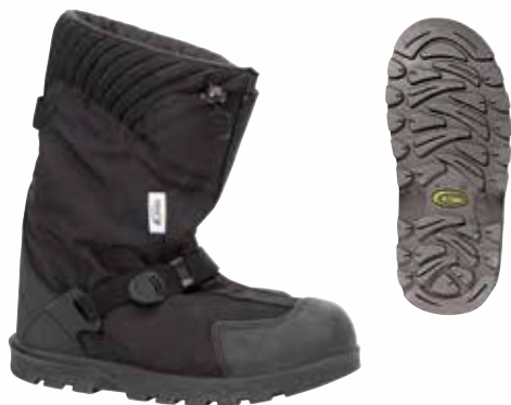
EXPG : Explorer™ Black, 11 in