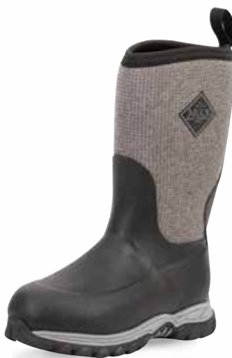
RG2-1HB | Black/Herringbone