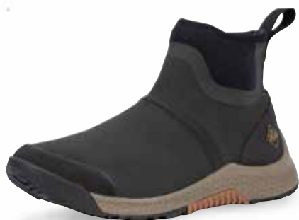
OSC-000 | Black