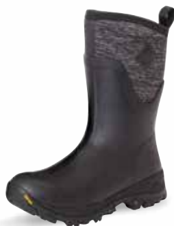
ASVMA-100 Black/Jersey Heather