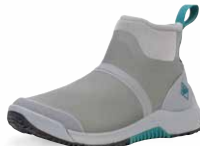
OSCW-101 | Frost/Gray