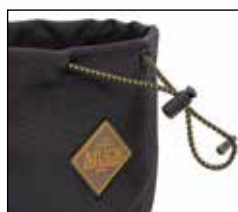
Loc-Tite Adjustable Closure System and MuckSTOP Nylon Gaiter collar provides a customized fit.