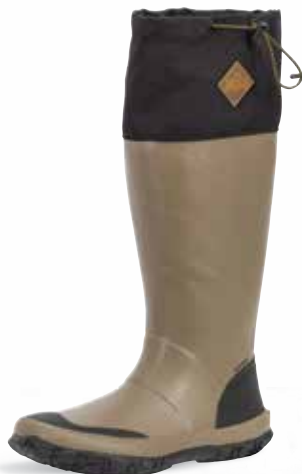
FOR-901 | Black/Tan