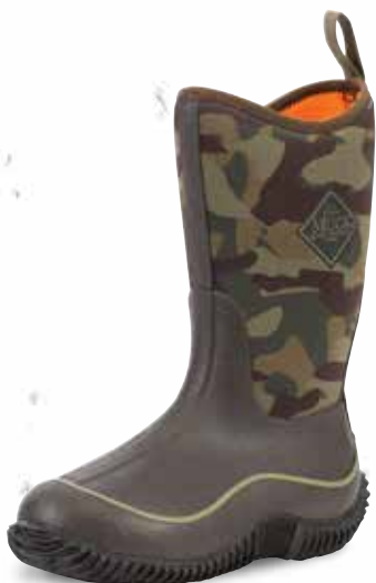
KBH-CAM | Brown/Classic Camo