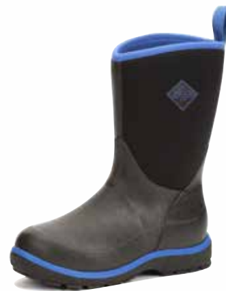
KEL-501 | Black/Blue