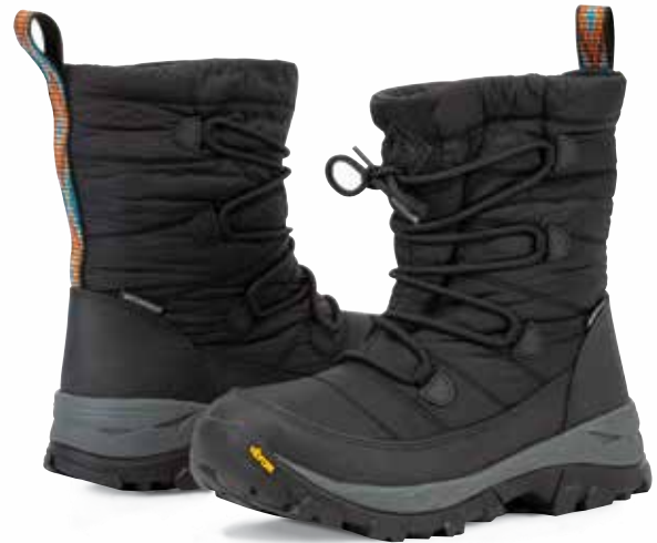
NWVA-000 | Black