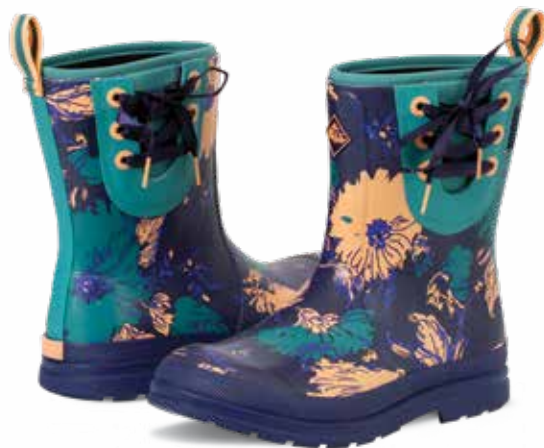
OMW-5FLR Astral Aura/Floral