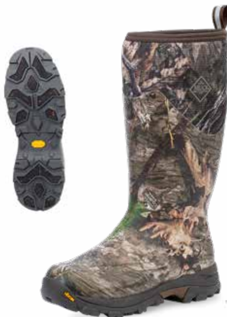
AVTVA-MDNA | Mossy Oak Country DNA®