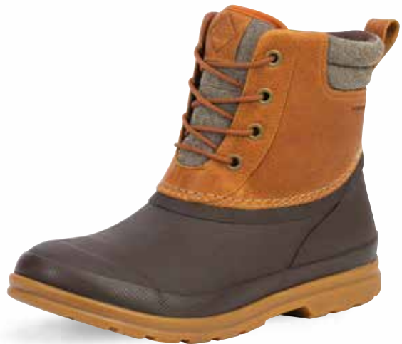
ODL-902 | Tan/Dark Brown