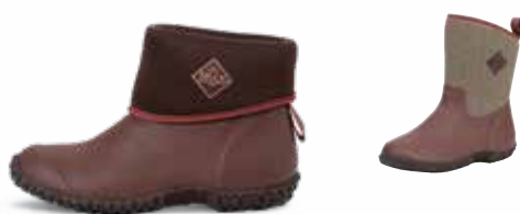
WM2-9TW | Rum Raisin/Herringbone