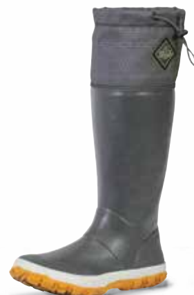
FOR-101 | Dark Gray/Print