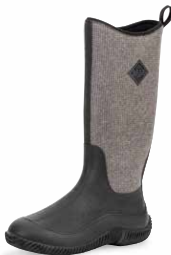
HAW-1HB | Black w/Fuzzy Herringbone