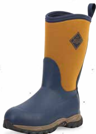
RG2-902 | Navy/Tan