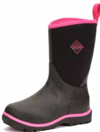
KEL-401 | Black/Pink