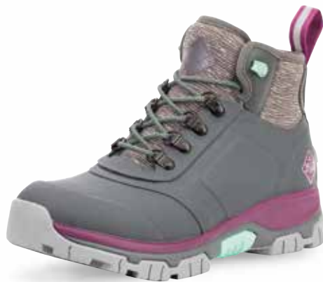
AXWL-101 | Dark Shadow