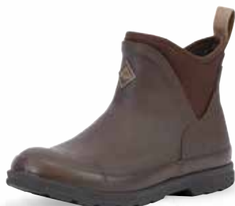
OAW-900 | Brown