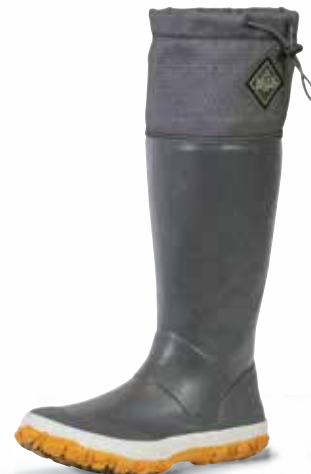
FOR-101 | Dark Gray/Print