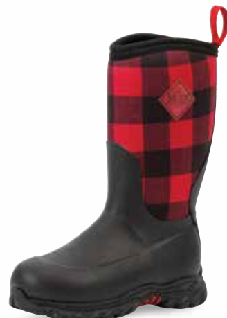
RG2-6PLD | Black/Plaid