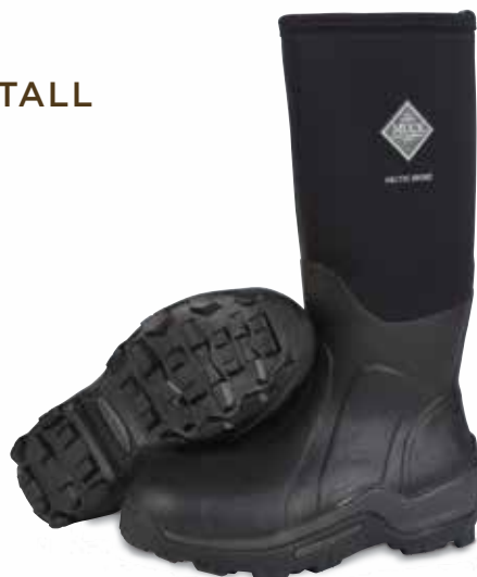
ASP-000A | Black