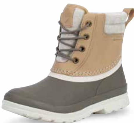
ODLW-901 | Taupe/Walnut