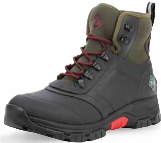
AXML-000 | Black