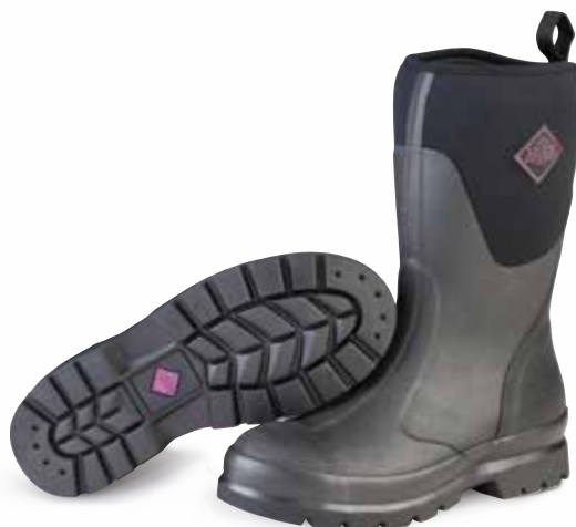
WCHM-000 | Black