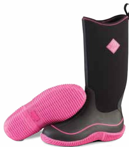
HAW-404 | Black/Hot Pink