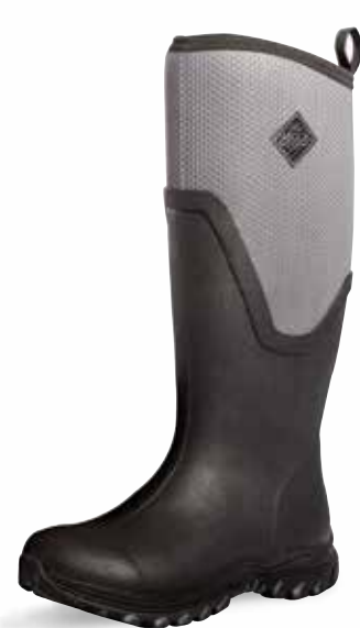
AS2T-101 | Gray