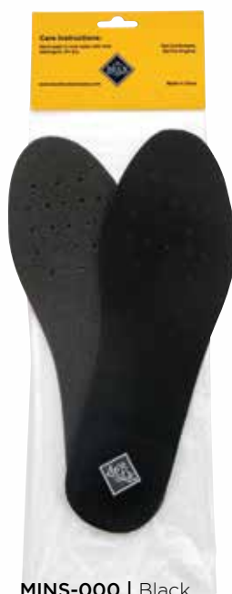
MINS-000 | Black