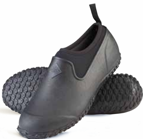
M2LW-000 | Black