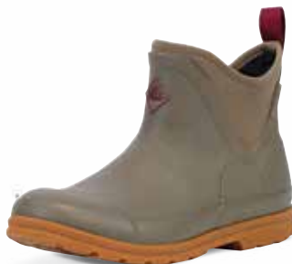
OAW-901 | Taupe