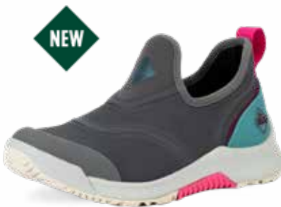
OSSW-104 | Dark Gray/Teal/Pink