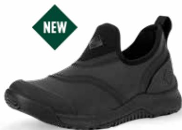
OSS-001 | Black