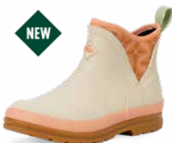
OAW-104 | Oatmeal/Print