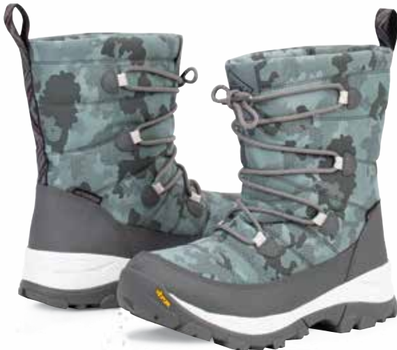
NWVA-101 | Castlerock/Trooper Camo