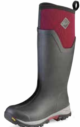
ASVTA-600 Black/Windsor Wine