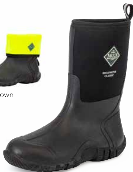
ECM-000 | Black ASTM F2892-18 EH