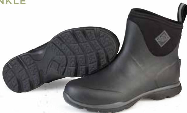
AELA-000 | Black/Gray