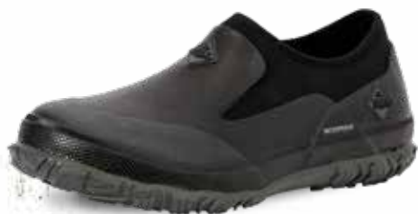
FRL-000 | Black