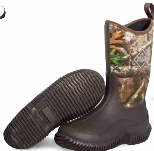
KBH-RTE | Brown/Realtree EDGE™