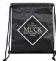
Muck Tuck Sack