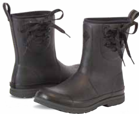
OMW-000 | Black