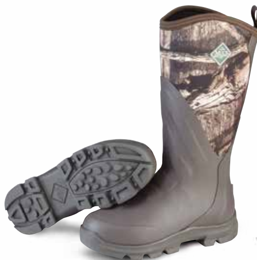
WDC-INF | Mossy Oak Infinity®