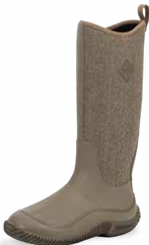
HAW-9TW | Walnut w/Herringbone