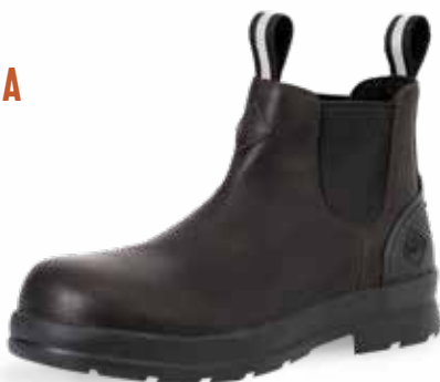
CCLP-900 | Black Coffee ASTM F2892-18 EH