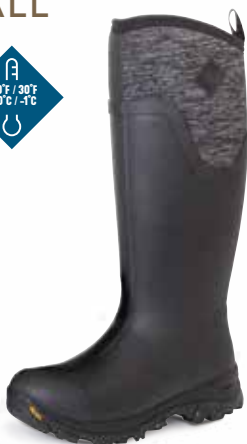
ASVTA-100 Black/Jersey Heather