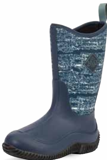
KBH-201 | Dress Blues/Trooper/Digital Terrain Print