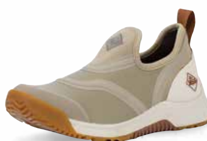
OSSW-901 | Crockery