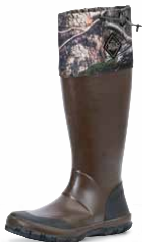
FOR-MDNA | Mossy Oak Country DNA®