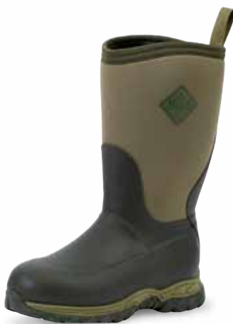
RG2-300 | Green