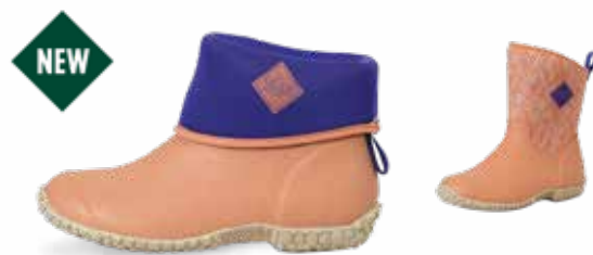
WM2-4WT | Muted Clay/Wheat Print