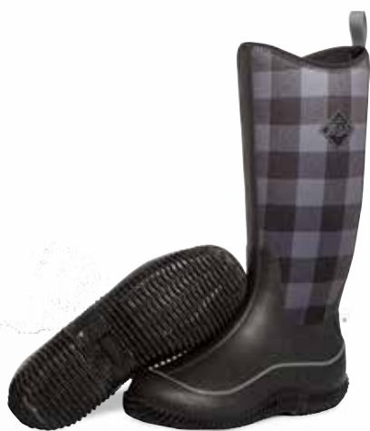
HAW-1PLD | Black/Gray Plaid