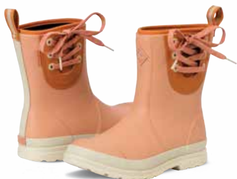
OMW-401 | Muted Clay