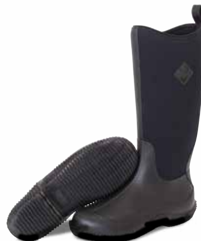
HAW-000 | Black