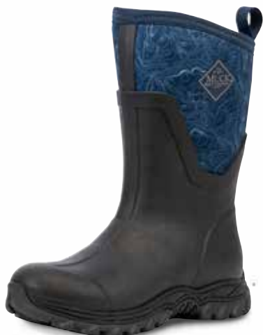
AS2M-201 | Black/Navy Topography