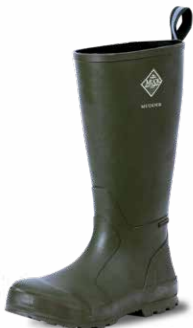
MUD-333 | Moss Green ASTM F2892-18 EH