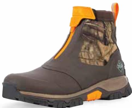
AXMZ-MOC Brown/Mossy Oak Break-Up Country®