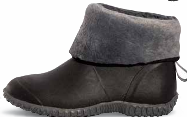
WM2-1PLD | Black/Gray Plaid