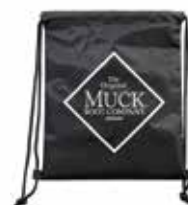
Muck Tuck Sack