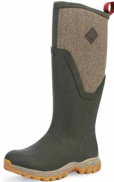
AS2T-3TW | Dark Olive/Herringbone