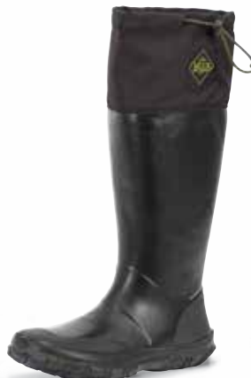
FOR-000 | Black