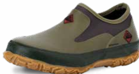
FRL-300 | Olive