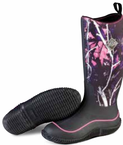
HAW-MSMG | Black/Muddy Girl® Camo