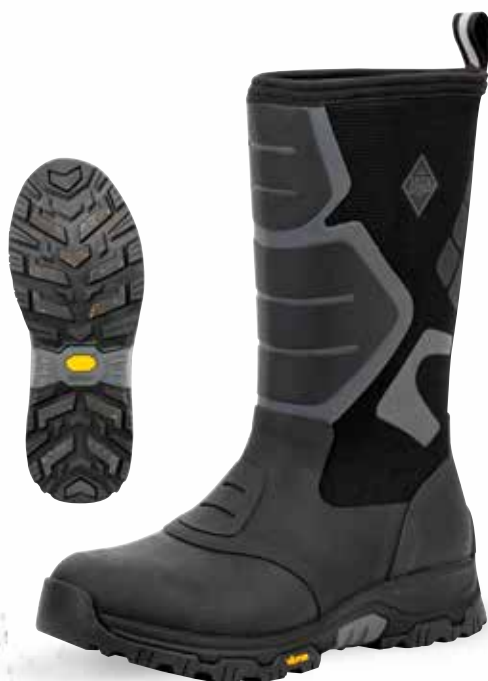
APMT-000 | Black