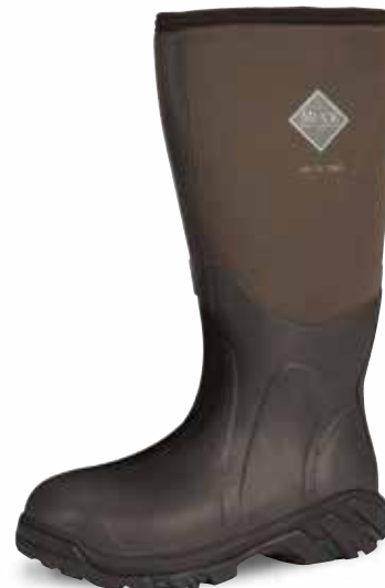
ACP-STL | Brown ASTM F2413-18 M/I/C EH