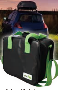
Waterproof Carrying bag