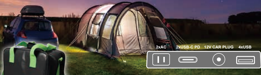
2xAC 2xUSB-C PD 12V CAR PLUG 4xUSB