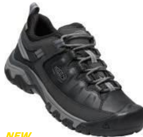
NEW Men's 1026329 Black/Steel Grey