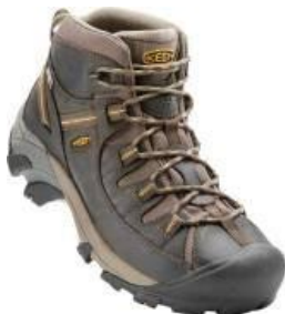
Men's 1002375 Black Olive/Yellow