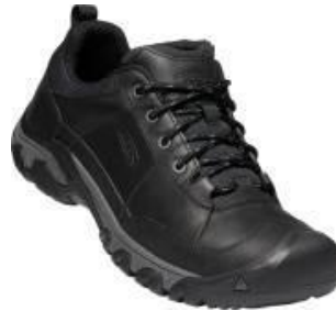
Men's 1022512 Black/Magnet