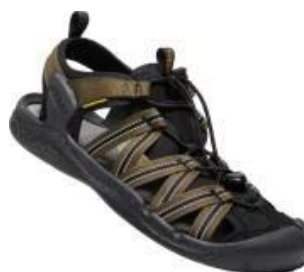
Men's 1026123 Dark Olive/Black