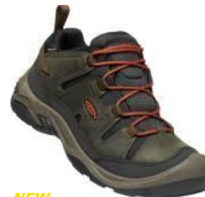
NEW Men's 1026774 Black Olive/Potters Clay