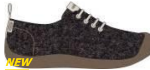
Men's 1026808 Taupe Felt/Birch