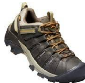
Men's 1002570 Black Olive/Inca Gold