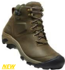
NEW Men's 1026727 Canteen/Green Plaid