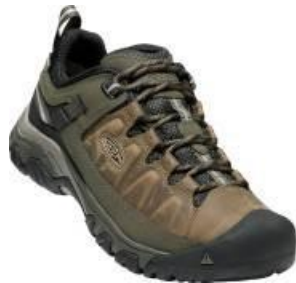
Men's 1018597 Bungee Cord/Black