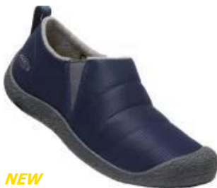
NEW Men's 1026858 Black Iris/Magnet

RETAIL $110.00 SIZES 7-15 (1/2 THRU 12)H