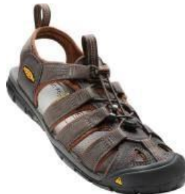
Men's 1014456 Raven/Tortoise Shell