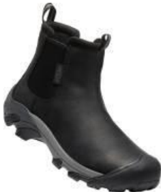
Men's 1025867 Black/Magnet