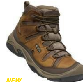
NEW Men's 1026769 Bison/Brindle