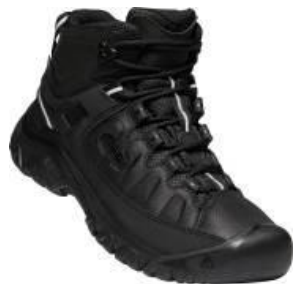
Men's 1023021 Black/Black