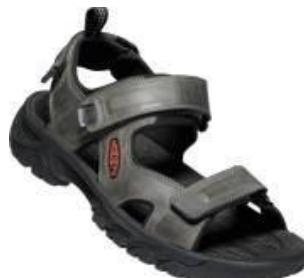
Men's 1022424 Grey/Black