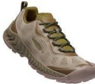
Men's 1026115 Canteen/Brindle