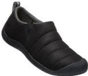
Men's 1025624 Black Felt/Black