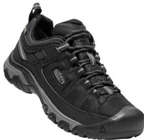
Men's 1017721 Black/Steel Grey