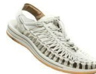
NEW Men's 1026867 Silver Birch/Silver Birch