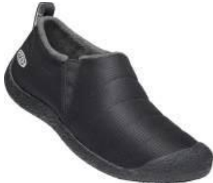
Men's 1023997 Triple Black