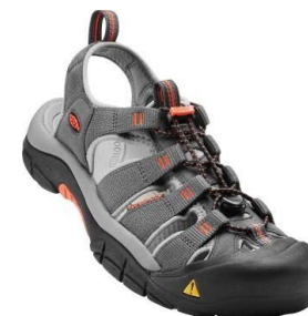
Men's 1016287 Magnet/Nasturtium