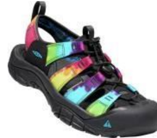
Men's 1018804 Original Tie Dye