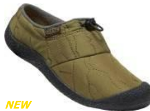
NEW Men's 1026655 Canteen/Plaza Taupe