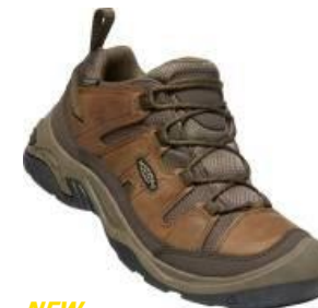
NEW Men's 1026773 Shitake/Brindle