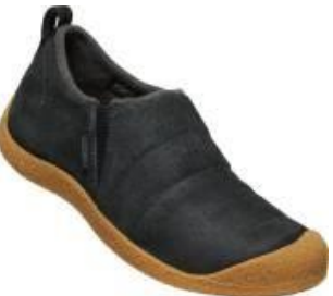
Men's 1026404 Black