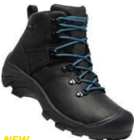
NEW Men's 1026585 Black/Legion Blue