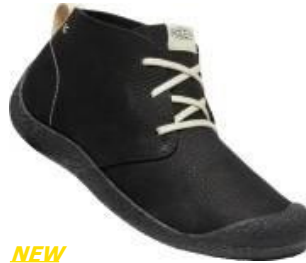
NEW Men's 1026461 Black/Black