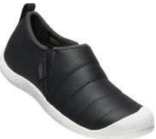
Men's 1026422 Black Perf