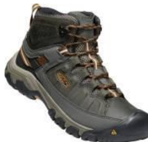
Men's 1017787 Black Olive/Golden Brown