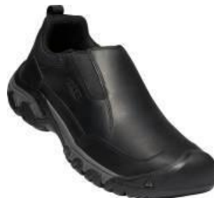
Men's 1022657 Black/Magnet