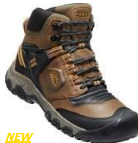
NEW Men's 1026687 Bison/Golden Brown