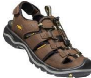
Men's 1014675 Bison/Black