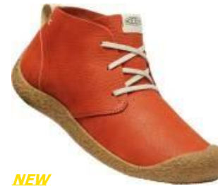
NEW Men's 1026463 Potters Clay/Birch