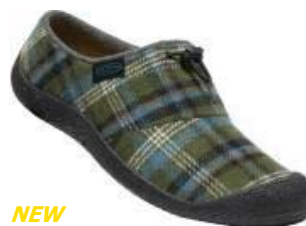
NEW Men's 1026656 Green Plaid/Black