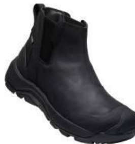
Men's 1025671 Black/Black