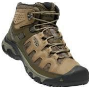
Men's 1019270 Olivia/Bungee Cord