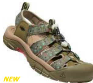
NEW Men's 1026873 Fujirock