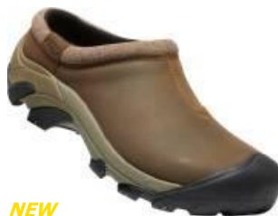
NEW Men's 1026725 Dark Earth/Black