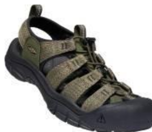
Men's 1022250 Forest Night/Black