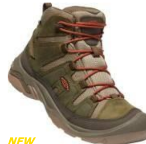
NEW Men's 1026766 Dark Olive/Potters Clay