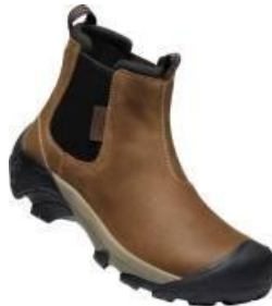
Men's 1025869 Veg Brown/Black