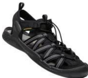
Men's 1026122 Black/Black