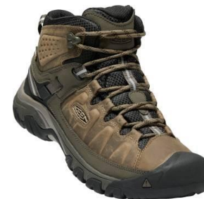
Men's 1017786 Bungee Cord/Black