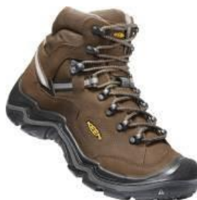
Men's 1020218 Cascade Brown/Gargoyle