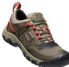
Men's 1024918 Timberwolf/Ketchup