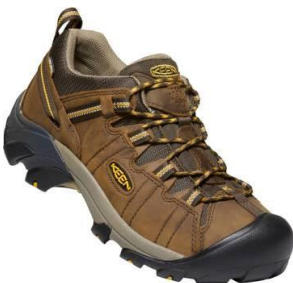
Men's 1015704 Cascade Brown/Golden Yellow