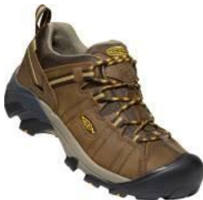
Men's 1008417 Cascade Brown/Golden Yellow