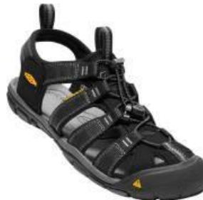
Men's 1008660 Black/Gargoyle