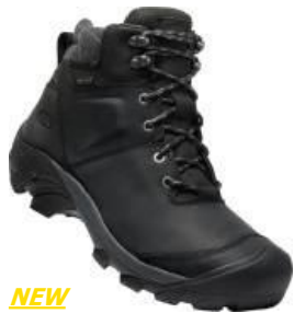
NEW Men's 1026729 Black/Black