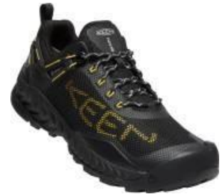
Men's 1025910 Black/Keen Yellow