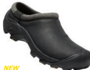
NEW Men's 1026726 Black/Black