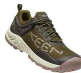
Men's 1025909 Dark Olive/Black Olive