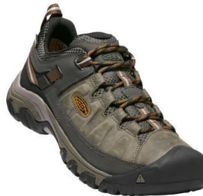
Men's 1017784 Black Olive/Golden Brown