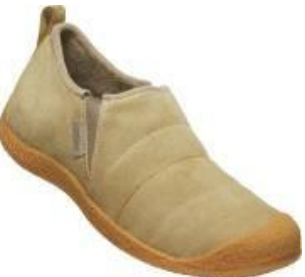
Men's 1026406 Beige