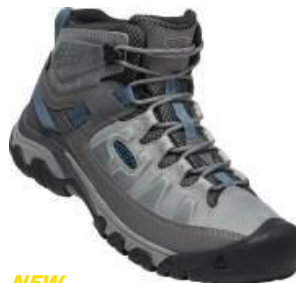
NEW Men's 1026862 Drizzle/Captains Blue