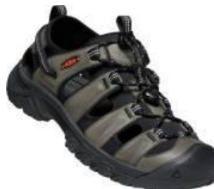
Men's 1022428 Grey/Black