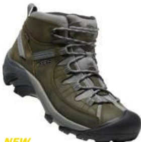
NEW Men's 1026584 Steel Grey/Magnet