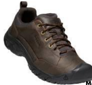
Men's 1022513 Dark Earth/Mulch