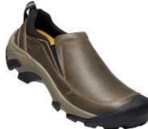
Men's 1025861 Grey/Black