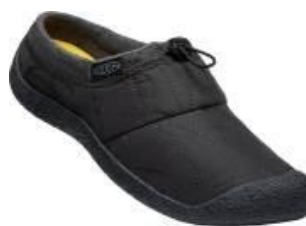
Men's 1025552 Triple Black/Black