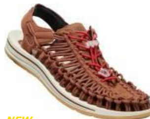
NEW Men's 1026868 Tortoise Shell/Red Carpet