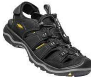
Men's 1014676 Black/Gargoyle