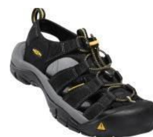
Men's 1001907 Black