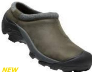
NEW Men's 1026724 Pewter/Black