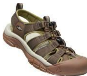
Men's 1025999 Olive Drab/Canteen