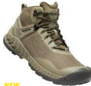
NEW Men's 1026679 Brindle/Canteen