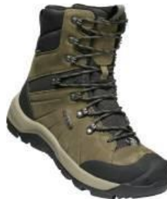
Men's 1023619 Canteen/Black