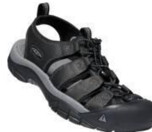
Men's 1022247 Black/Steel Grey