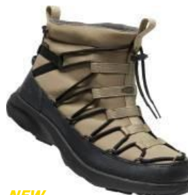
NEW Men's 1026594 Timberwolf/Black