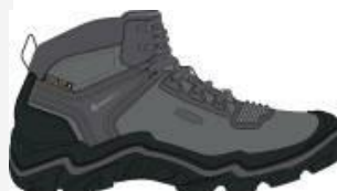
Men's 1026782 Magnet/Steel Grey