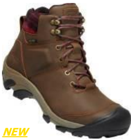
NEW Men's 1026728 Dark Earth/Red Plaid