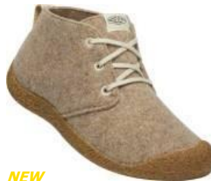
NEW Men's 1026806 Taupe Felt/Birch