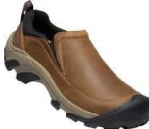
Men's 1025862 Veg Brown/Black