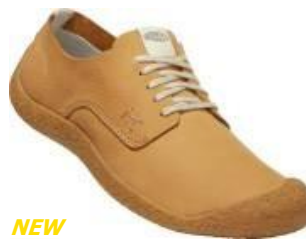
NEW Men's 1026460 Apple Cinnamon/Birch