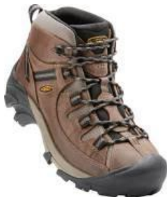
Men's 1008418 Shitake/Brindle