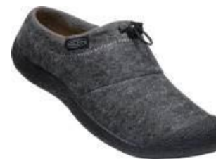
Men's 1025550 Charcoal Grey Felt/Black