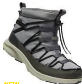
NEW Men's 1026595 Magnet/Black Olive