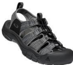
Men's 102252 Black/Steel Grey