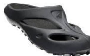
Men's 1018206 Black/Dawn Blue