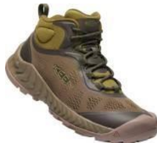
Men's 1026111 Canteen/Olive Drab