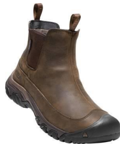
Men's 1017790 Dark Earth/Mulch