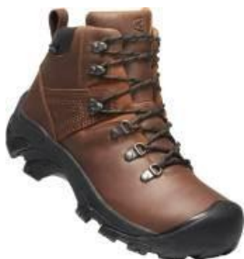
Men's 1002435 Syrup