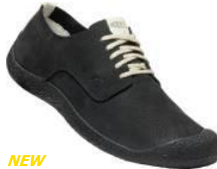
NEW Men's 1026459 Black/Black