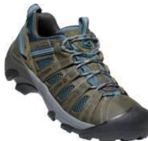
Men's 1018937 Alcatraz/Legion Blue

• Leather and performance mesh upper • Speed-lace webbing system for comfortably snug fit • Breathable mesh lining • Removable PU insole for long-lasting comfort • EVA midsole for lightweight cushioning • KEEN.ALL-TERRAIN rubber outsole for higher-traction grip Non-marking multi-directional lugs for increased traction 4mm multi-directional lugs for traction • External stability shank delivers lightweight support • Contoured heel lock for a more secure fit • Eco Anti-Odor for natural odor control • Environmentally preferred premium leather from LWG-certified tannery PFC-free, durable water repellent • ESS bruise plate for protection on uneven surfaces