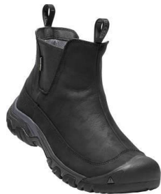
Men's 1017789 Black/Raven