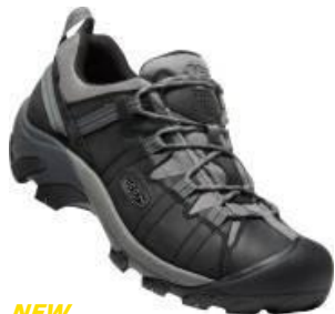
NEW Men's 1026583 Black/Steel Grey