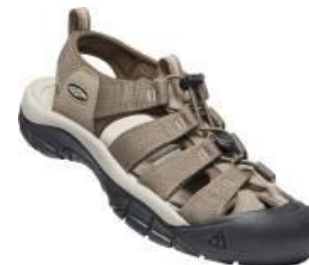
Men's 1024631 Brindle/Canteen