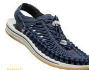
NEW Men's 1026866 Black Iris/Black Iris