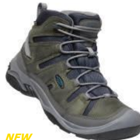
NEW Men's 1026767 Steel Grey/Legion Blue