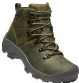
Men's 1026011 Dark Olive/Forest Night