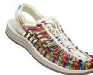
Men's 1025633 Original Tie Dye/Birch