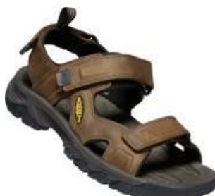
Men's 1022423 Bison/Mulch