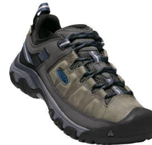
Men's 1017785 Steel Grey/Captains Blue