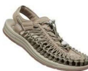
Men's 1025169 Timberwolf/Plaza Taupe