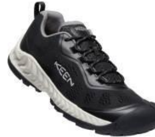
Men's 1026114 Black/Vapor