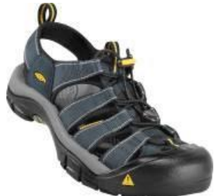
Men's 1001938 Navy/Medium Grey