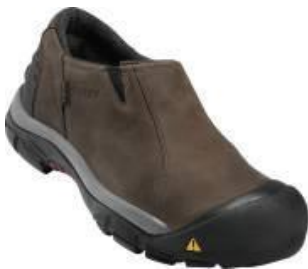
Men's 1002269 Slate Black/Madder Brown