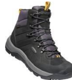
Men's 1023618 Black/Magnet