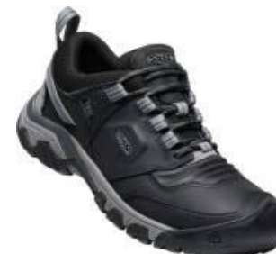
Men's 1024916 Black/Magnet