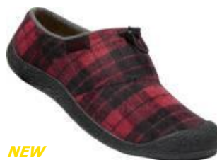
NEW Men's 1026654 Rhubarb Plaid/Black