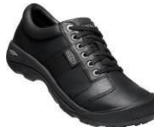
Men's 1002990 Black