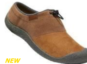
NEW Men's 1026659 Bison Cord/Toasted Coconut