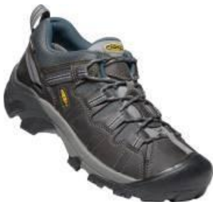
Men's 1002363 Gargoyle/Midnight Navy