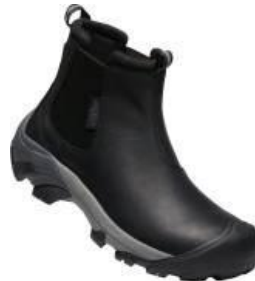
Men's 1025868 Grey/Black