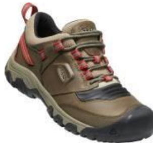
Men's 1025417 Timberwolf/Ketchup

Waterproof leather and performance mesh upper Speed-lace webbing system for comfortably snug fit Quick-dry lining for active use Removable PU insole for long-lasting comfort Compression-molded EVA midsole for cushioning KEEN.ALL-TERRAIN rubber outsole for higher-traction grip Non-marking multi-directional lugs for increased traction 5mm multi-directional lugs for traction Stability shank delivers lightweight support Heel-capture system for added stability KEEN.DRY waterproof, breathable membrane Eco Anti-Odor for natural odor control Environmentally preferred premium leather from LWG-certified tannery PFC-free, durable water repellent