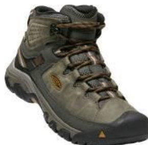
Men's 1018596 Black Olive/Golden Brown

Leather and performance mesh upper Speed-lace webbing system for comfortably snug fit Quick-dry lining for active use Removable PU insole for long-lasting comfort EVA midsole for lightweight cushioning KEEN.ALL-TERRAIN rubber outsole for higher-traction grip Non-marking multi-directional lugs for increased traction 4mm multi-directional lugs for traction External stability shank delivers lightweight support Injected TPU heel-capture system for stability KEEN.DRY waterproof, breathable membrane Eco Anti-Odor for natural odor control Environmentally preferred premium leather from LWG-certified tannery PFC-free, durable water repellent