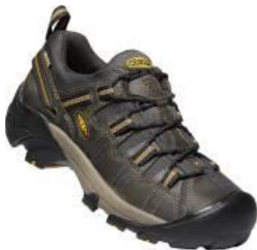
Men's 1012213 Raven/Tawny Olive