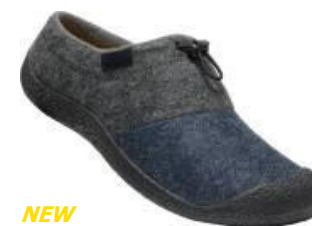
NEW Men's 1026658 Black Iris Felt/Magnet