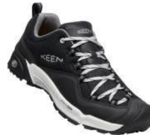
Men's 1025916 Black/Vapor