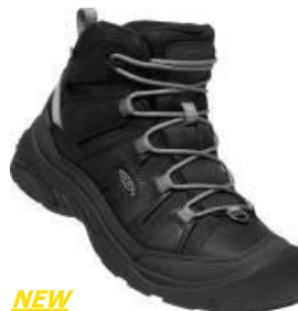
Men's 1026761 Steel Grey/Legion Blue