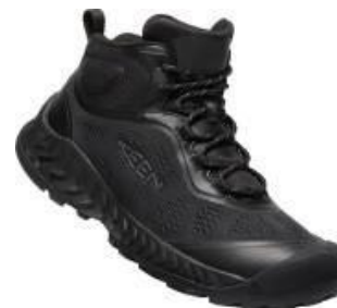
Men's 1026110 Black/Magnet