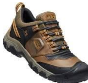
Men's 1025667 Bison/Golden Brown