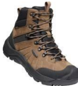
Men's 1024136 Dark Earth/Caramel Cafe