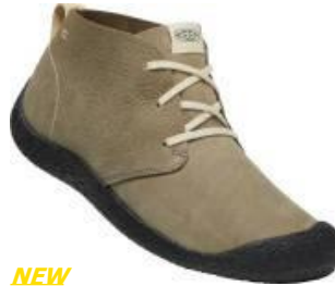
NEW Men's 1026462 Dark Olive/Black