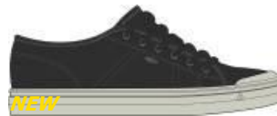
Men's 1026837 Beige/Silver Birch