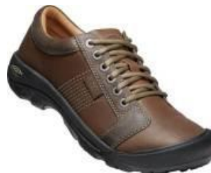
Men's 1007722 Chocolate Brown