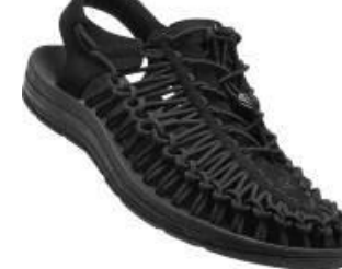
Men's 1014097 Black/Black