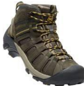
Men's 1008904 Raven/Tawny Olive

Leather and performance mesh upper Speed-lace webbing system for comfortably snug fit Breathable mesh lining Removable PU insole for long-lasting comfort EVA midsole for lightweight cushioning KEEN.ALL-TERRAIN rubber outsole for higher-traction grip Non-marking multi-directional lugs for increased traction 4mm multi-directional lugs for traction External stability shank delivers lightweight support Contoured heel lock for a more secure fit Eco Anti-Odor for natural odor control Environmentally preferred premium leather from LWG-certified tannery PFC-free, durable water repellent ESS bruise plate for protection on uneven surfaces