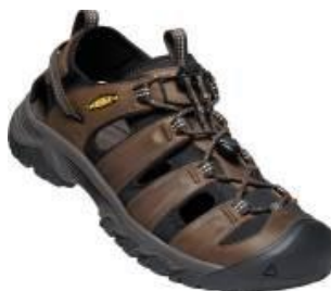
Men's 1022427 Bison/Mulch