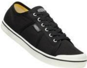
Men's 1026465 Black/Star White