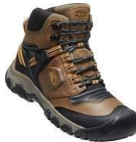
Men's 1025666 Bison/Golden Brown