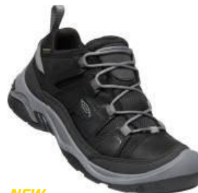
NEW Men's 1026775 Black/Steel Grey