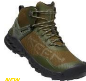
NEW Men's 1026678 Forest Night/Dark Olive