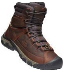
Men's 1019914 Cocoa/Mulch