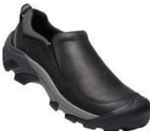
Men's 1025860 Black/Black