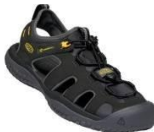
Men's 1022246 Black/Gold