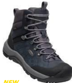
NEW Men's 1026600 Blue Nights/Magnet