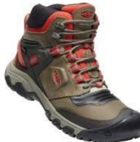
Men's 1025416 Dark Olive/Ketchup