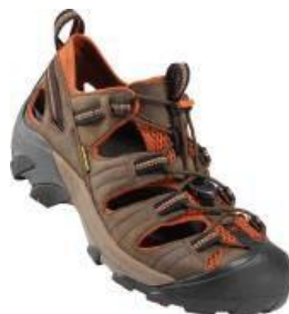
Men's 1008419 Black Olive/Bombay Brown

Waterproof leather upper Lace-lock bungee system Quick-dry lining for active use EVA insole with arch support for all-day comfort EVA midsole for lightweight cushioning KEEN.ALL-TERRAIN rubber outsole for higher-traction grip Non-marking multi-directional lugs for increased traction 5mm multi-directional lugs for traction Stability shank delivers lightweight support Heel-capture system for added stability Eco Anti-Odor for natural odor control Environmentally preferred premium leather from LWG-certified tannery PFC-free, durable water repellent