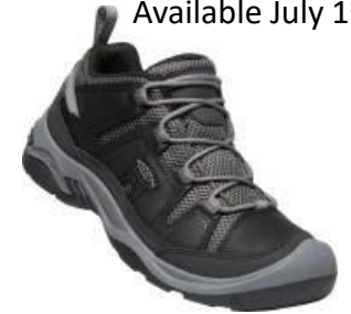
Men's 1026779 Steel Grey/Legion Blue