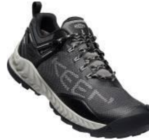
Men's 1026109 Magnet/Vapor