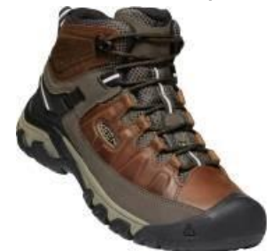
Men's 1023030 Chestnut/Mulch