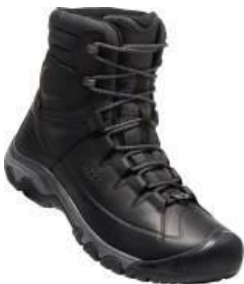
Men's 1019913 Black/Raven