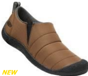
NEW Men's 1026859 Dark Earth/Black