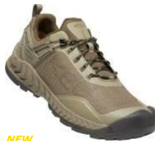
NEW Men's 1026681 Brindle/Canteen