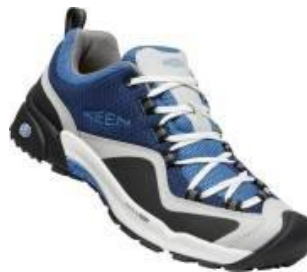
Men's 1025915 Blue Depths/Bright Cobalt