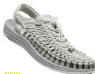
NEW Men's 1026865 Pt-01