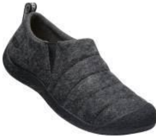
Men's 1025625 Charcoal Grey Felt/Black