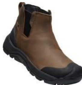
Men's 1025559 Canteen/Black