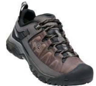
Men's 1017783 Bungee Cord/Black