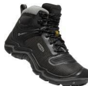
Men's 1025957 Black/Magnet