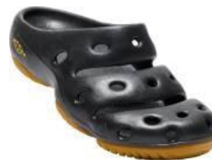
Men's 1001966 Black