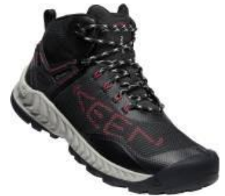
Men's 1025908 Black/Red Carpet