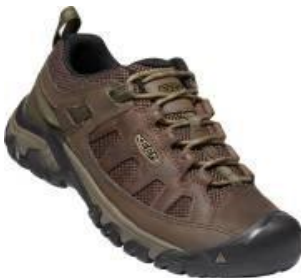
Men's 1018577 Cuban/Antique Bronze