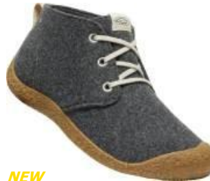
NEW Men's 1026807 Charcoal Grey Felt/Birch