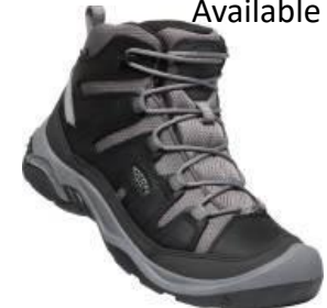
NEW Men's 1026768 Black/Steel Grey