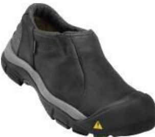
Men's 1002268 Black/Gargoyles