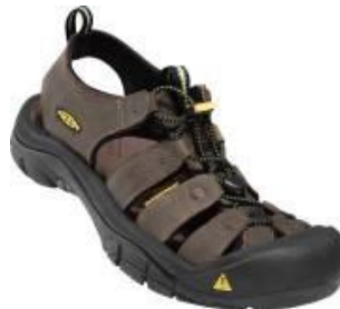
Men's 1001870 Bison