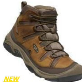
NEW Men's 1026841 Bison/Brindle