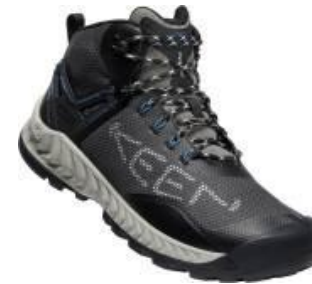
Men's 1026108 Magnet/Bright Cobalt