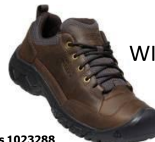
Men's 1023288 Dark Earth/Mulch