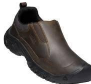
Men's 1022658 Dark Earth/Mulch