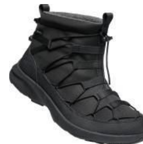
Men's 1023553 Triple Black/Black