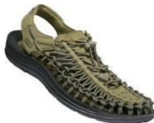
Men's 1023381 Dark Olive/Black