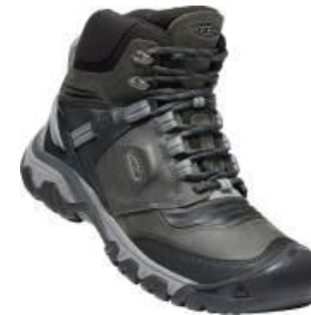
Men's 1024911 Magnet/Black