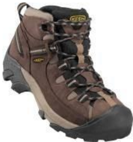
Men's 1012126 Shitake/Brindle