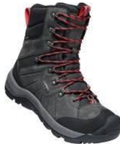
Men's 1023621 Magnet/Red Carpet