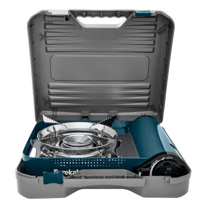
CARRY CASE INCLUDED