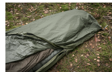
WARNING: Suffocation Risk! User should always use the mesh vent and no seal themselves completely in the Bivvi Bag